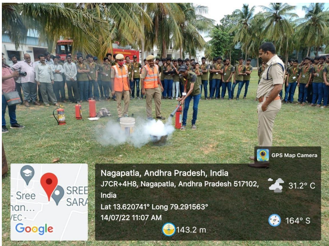
NSS Volunteer is performing the activity on controlling the fire hazards.