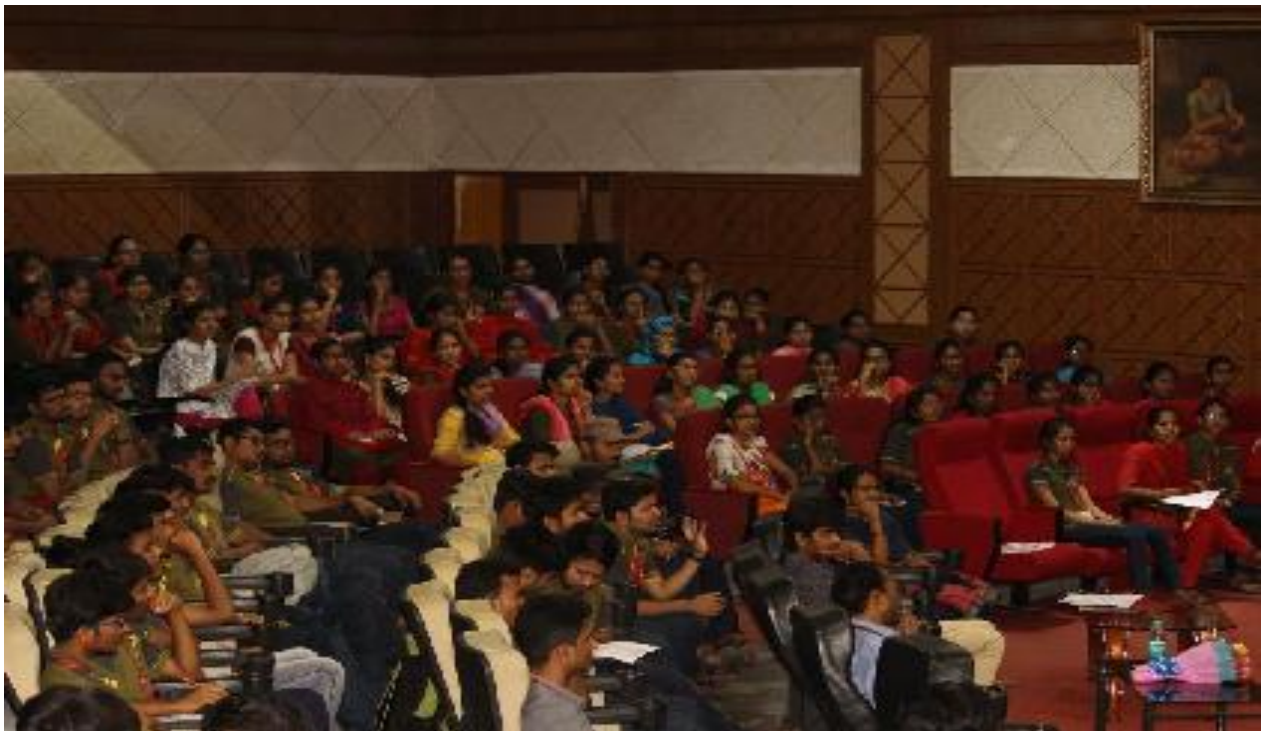
Faculty and Students Listening to the Chief Guest