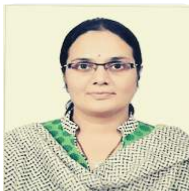
Lakshmi Kalam Rishi Engineering College (for women)