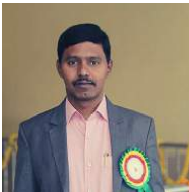
Surendra Naidu Ananthalakshmi Institute of Technology and Sciences