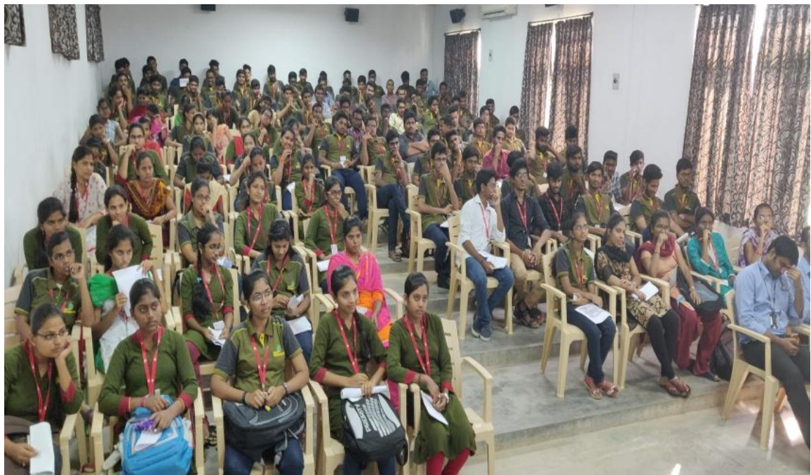
Students gaining knowledge about the electoral process