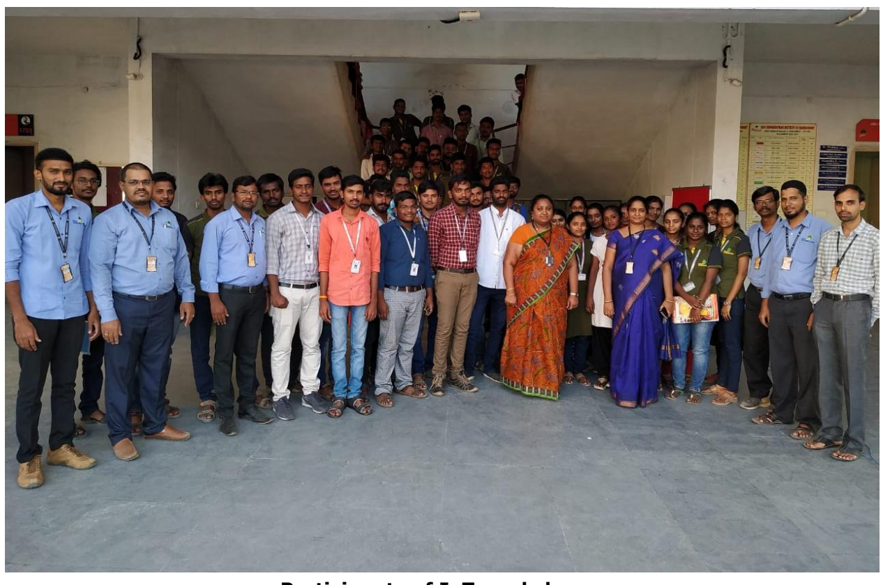
Participants of IoT workshop