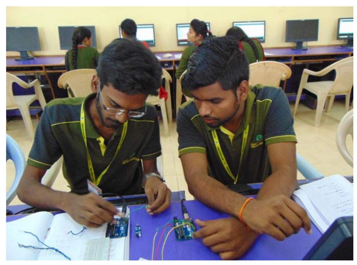
Participants working on IoT using Arduino Tool Kit