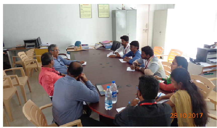
Student Officer Planning Meeting with Practitioner Advisor-1

Around nine official meetings were conducted in the year leap. In addition, these meetings helped to monitor the timely progress of the student chapter.