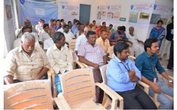
Faculty, Students and Villagers Listening to the Chief Guest