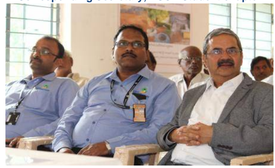
Chief Guest and other Dignitaries assembled for the program along with the villagers