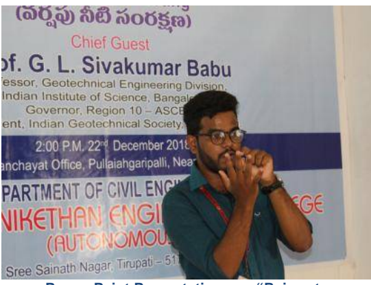
Power Point Presentation on "Rainwater Harvesting" to the Village Community by

Chief Guest and other dignitaries in their address reiterated the importance of rainwater harvesting in order to improve ground water resources and reduce the water scarcity in the village. Further, they explained the need of safeguarding water resources for the benefit of future