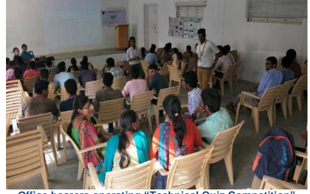
Office bearers operating "Technical Quiz Competition" under ASCE SVEC Student Chapter