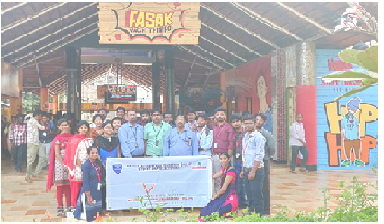
Entire Team of ASCE SVEC Student Chapter at FASAK Canteen