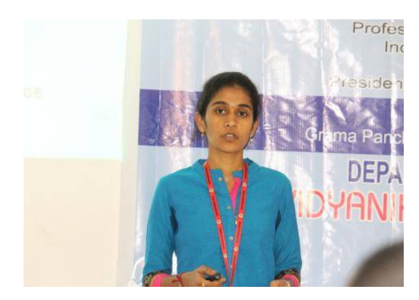
Power Point Presentation on "Rainwater Harvesting"