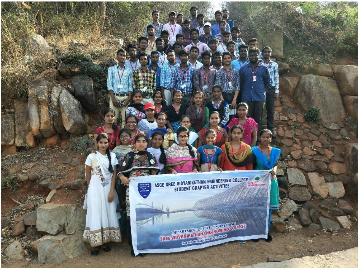
II B.Tech. II Sem. CE B-Section Students at the Field Visit to Kalyani Dam, A. Rangampet.