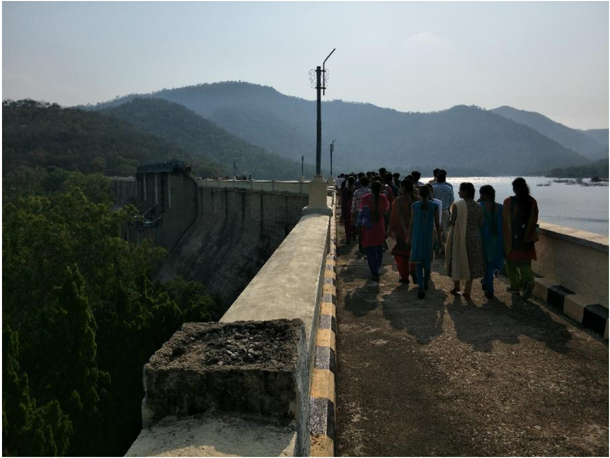
Students at the Field Visit to Kalyani Dam, A. Rangampet.