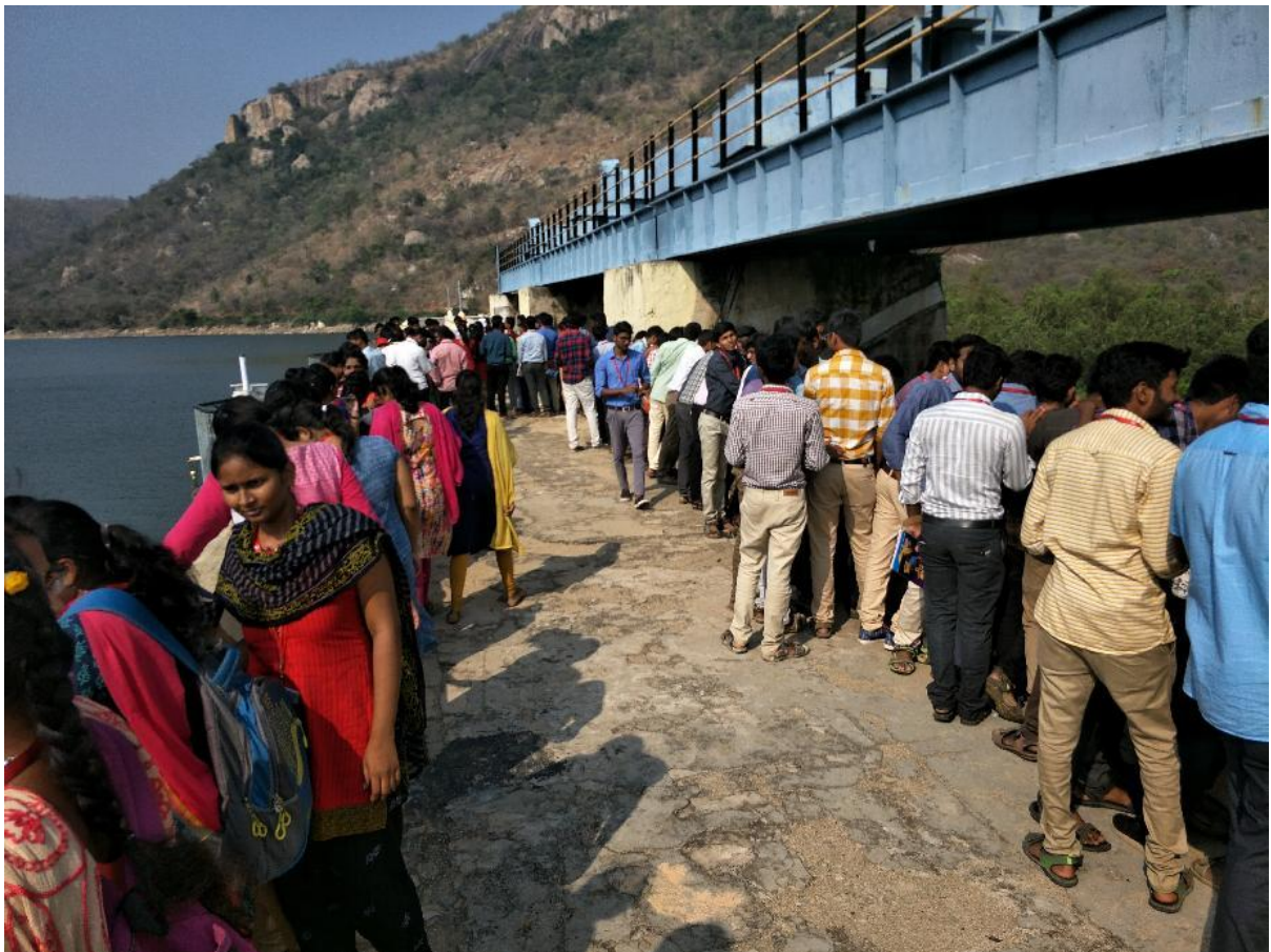
Students at the Field Visit to Kalyani Dam, A. Rangampet.