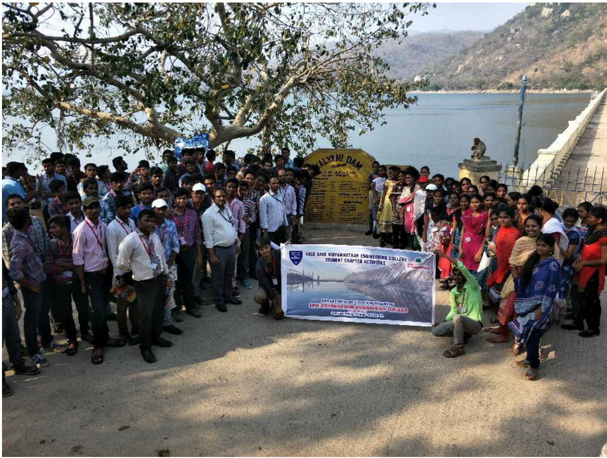
II B.Tech. II Sem. CE Students at the Field Visit to Kalyani Dam, A. Rangampet.