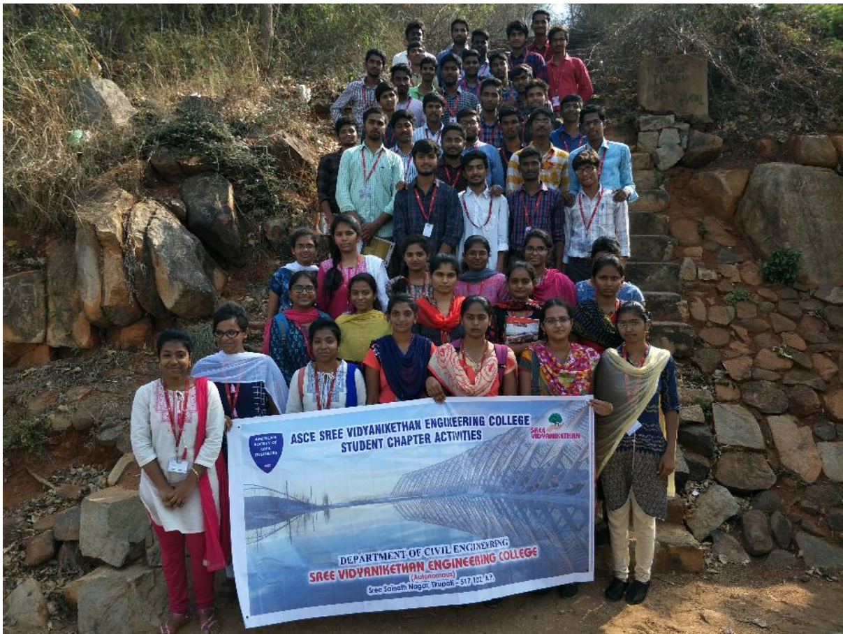
II B.Tech. II Sem. CE A-Section Students at the Field Visit to Kalyani Dam, A. Rangampet.