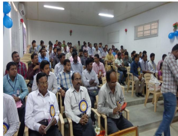
A section of Participants and invitees