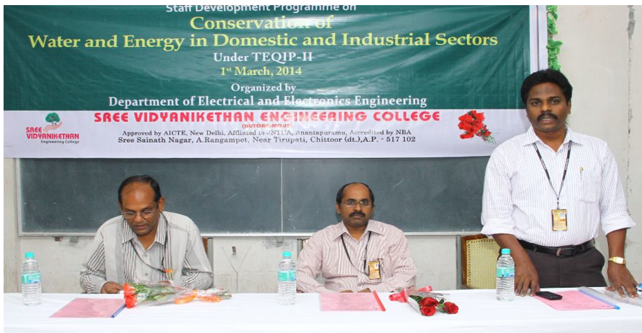
Address by Chief Guest, Resource person and Head of Department

A One day staff development programme was conducted by the department of EEE on 01/03/2014 for Technical staff, Non-Teaching staff of various engineering colleges within the state and also for in house technical staff. The staff development programme was conducted to impart awareness about the importance of water and energy in present premises, on the current issues and problems on shortage of water and energy and various methods of conserve them.