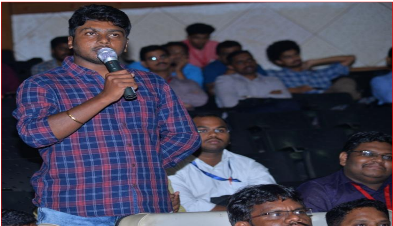
Participants from Academia, Industry, Government Officials and scientists from Research Organizations