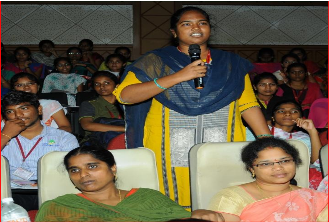
Participants interacting with the experts