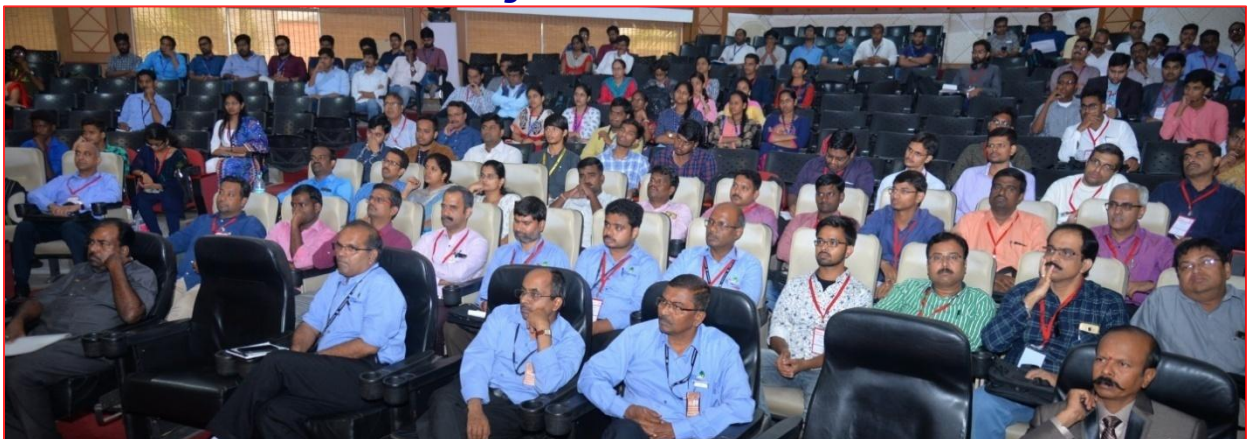
Participants from Academia, Industry, Government Officials and scientists from Research Organizations