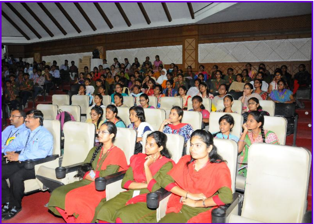
Faculty and Students Listening to the Seminar on “Innovations and Implementations (Concrete and Foundations) – Two Effective Tools for Success”