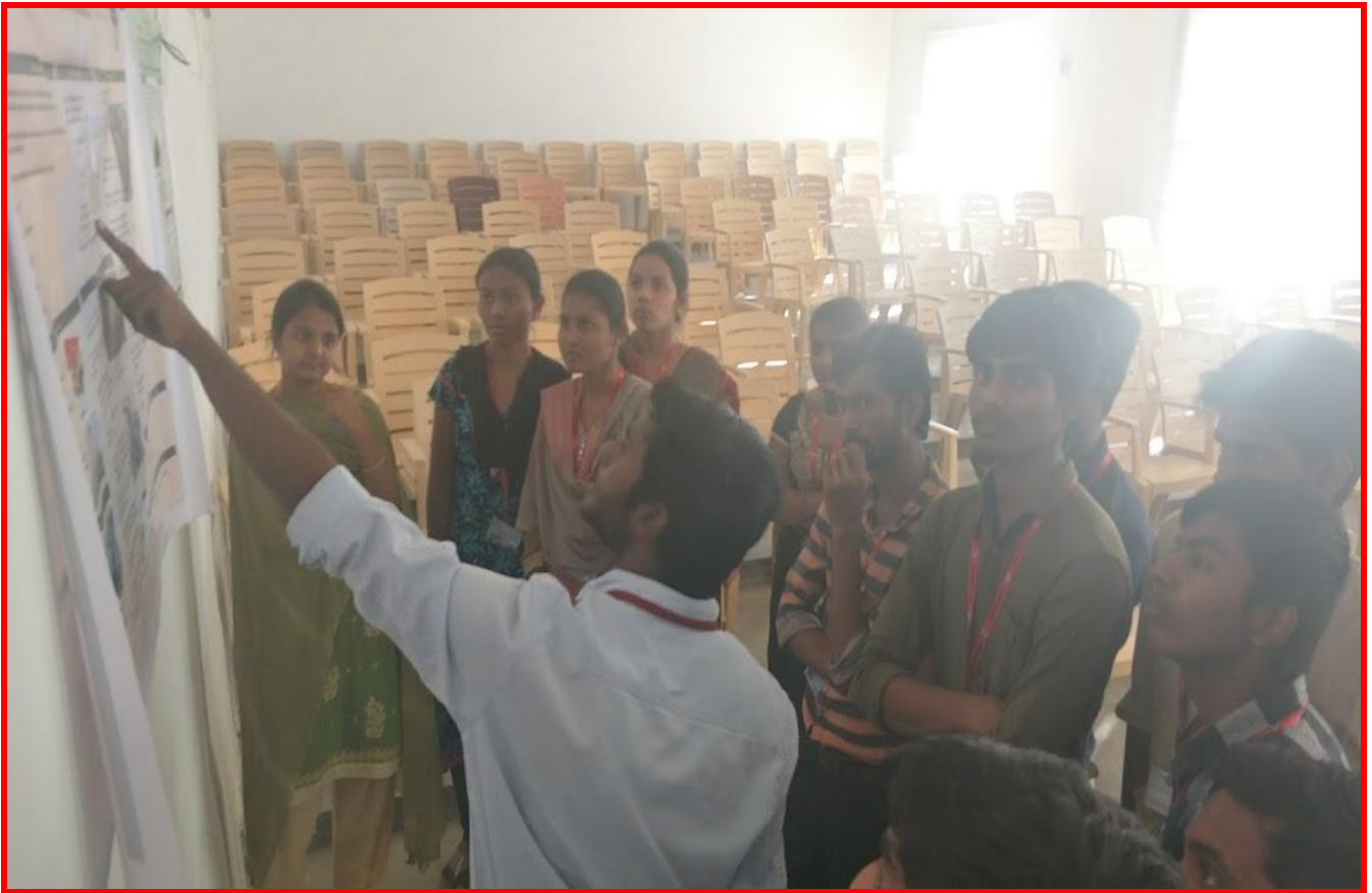
Students Listening to the Poster Presentation