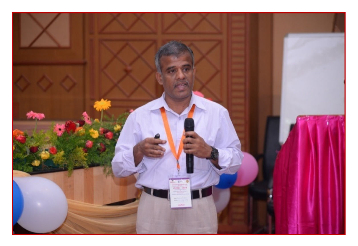
Paper Presentation session