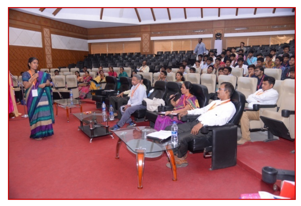
Paper Presentation session