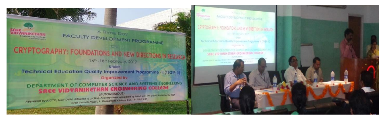
Entrance banner at the venue

This FDP mainly focused on Advances in Cryptography, Public Key Cryptosystems, Block Chain Technology, Applications of Public Key Cryptosystems, Post Quantum Cryptography and Randomness. The members of faculty from different colleges across the nation attended the FDP.