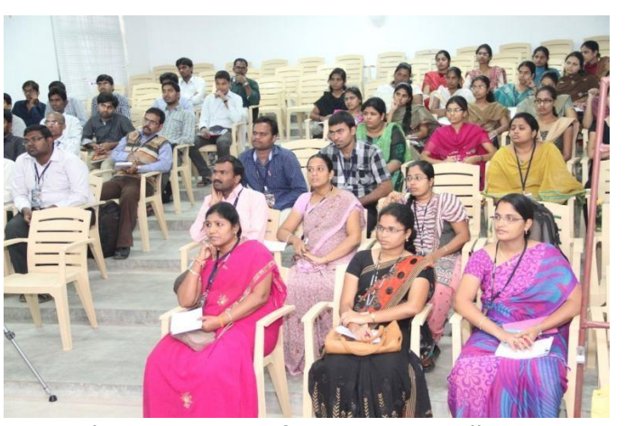
The Participants from Various colleges