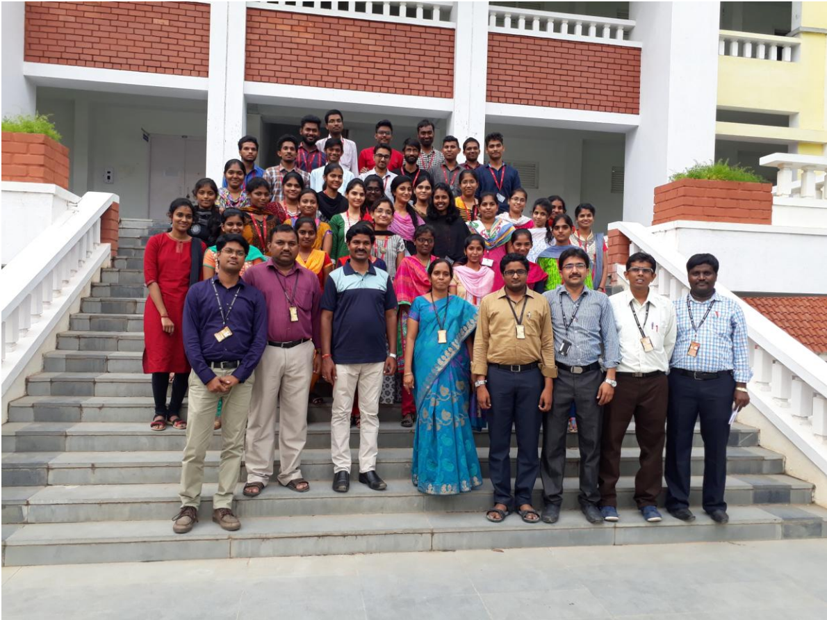
Resource Persons, Convener, Coordinators and Participants at Three Day Skill Development Programme on Open Source Tools