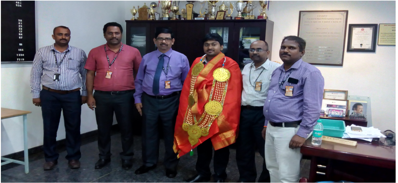
Felicitation to Resource Person