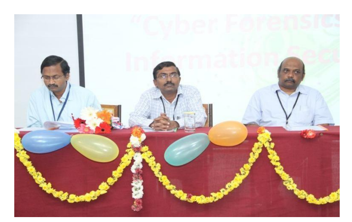
Dignitaries on the Dais during the Inaugural function

The faculty from various colleges across the nation attended the FDP.