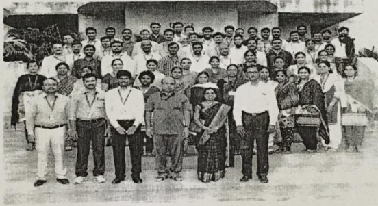
Participants in the Valedictory Function with Resource Person.