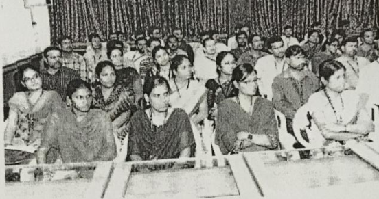
Participants During the Session