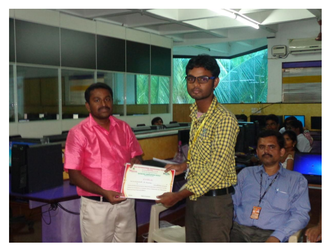
Certificate Distribution for the Participants in the Valedictory Function ByResource Person.