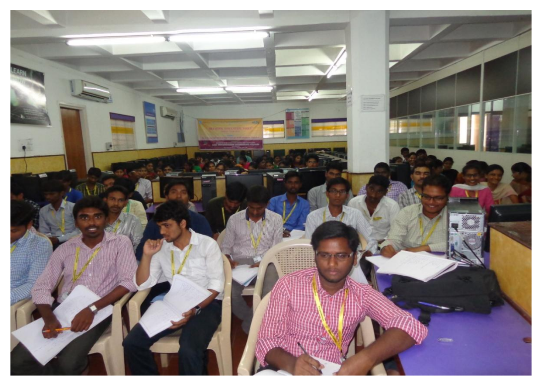
Participants During the Session