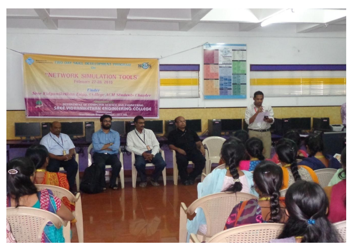
Inaugural Function Being Attended by Convener and Other Dignitaries.