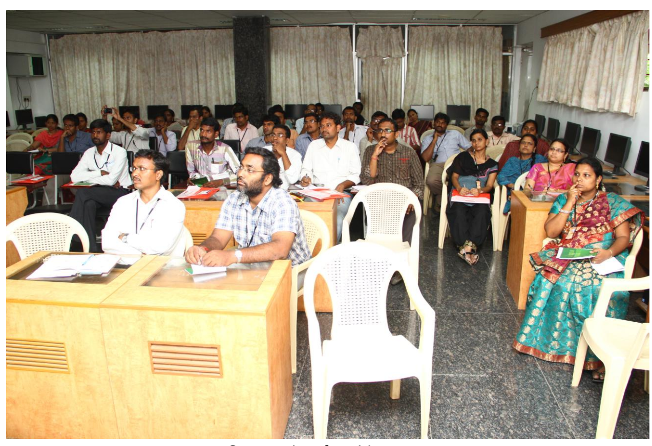
Cross section of participants