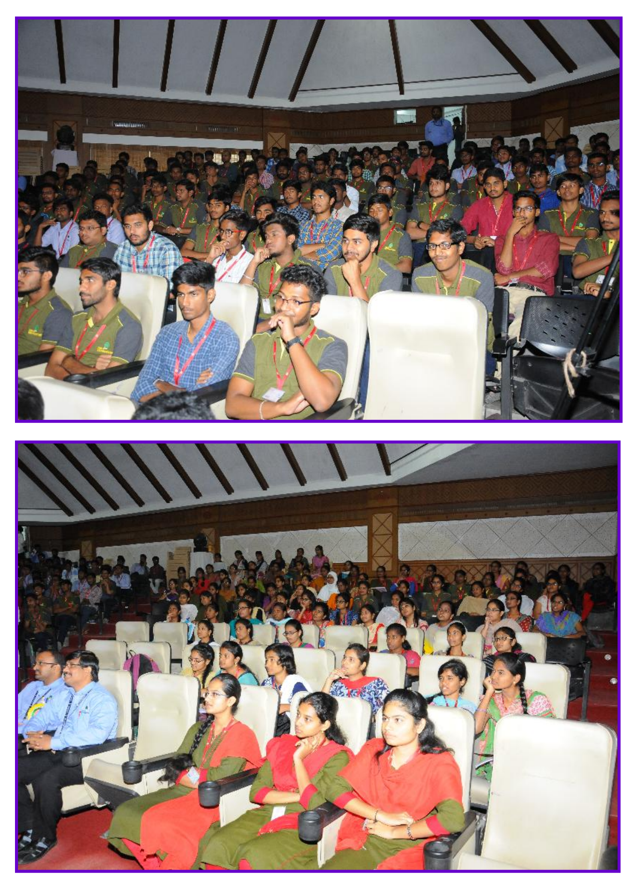
Faculty and Students Listening to the Seminar on "Innovations and Implementations (Concrete and Foundations) – Two Effective Tools for Success"