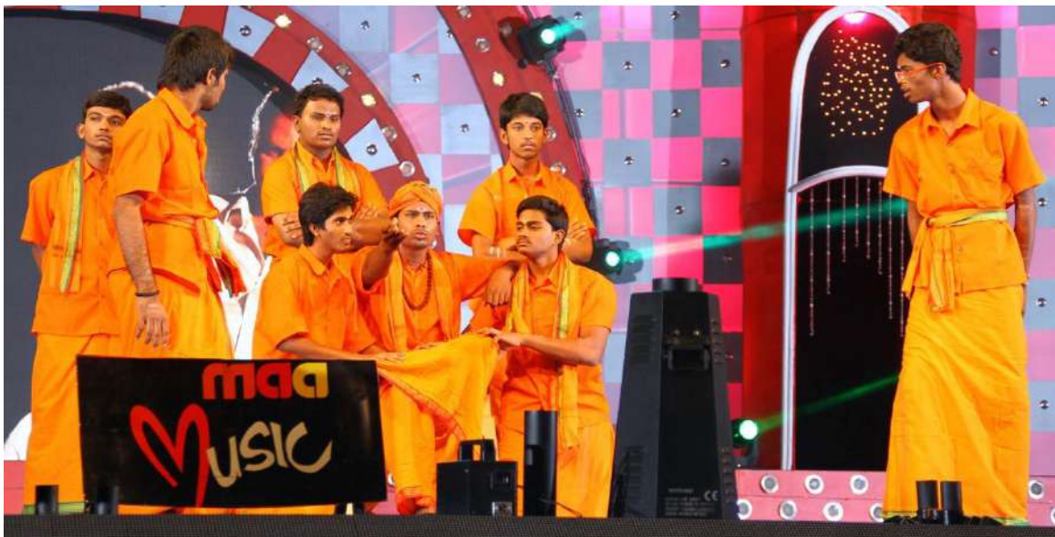
A hilarious skit by students