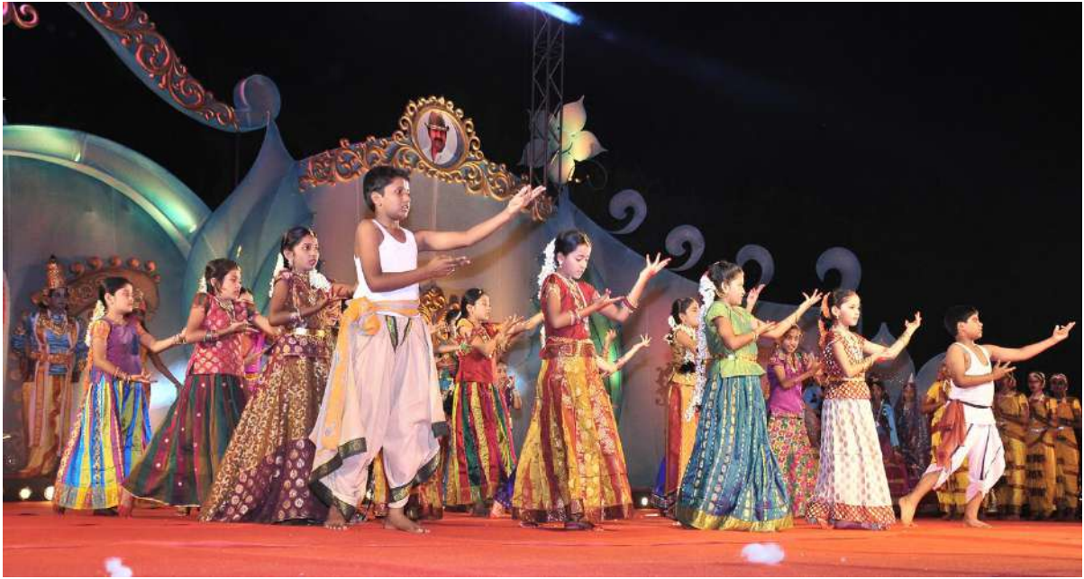
Dance Programme by SVIS