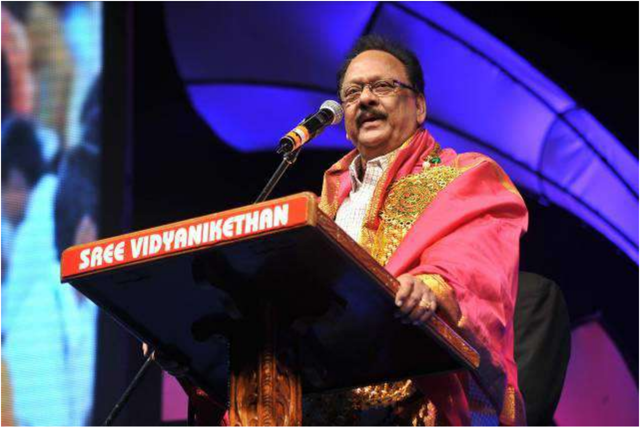
Sri U.V. Krishnam Raju sharing his memories with the audience