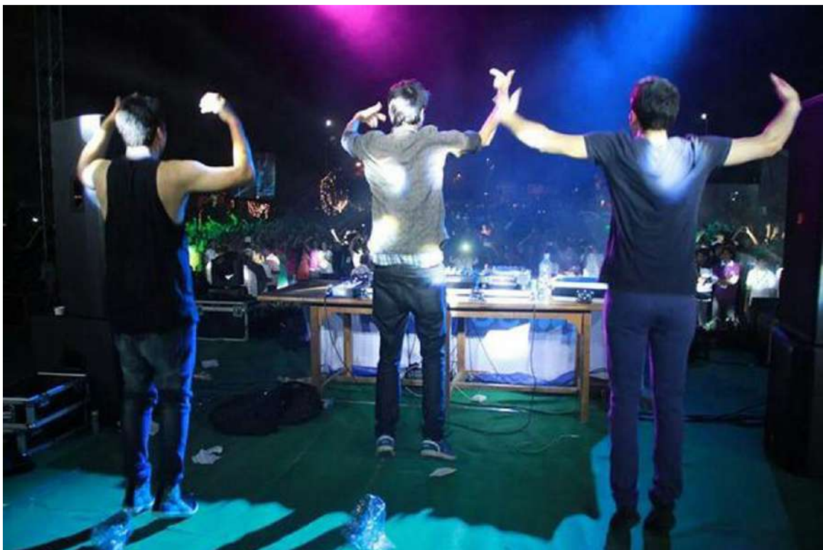
A Startling performance by SUNBURN DJ from Goa