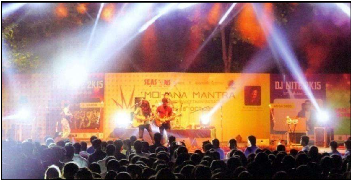
Students enjoying Musical Night Performance