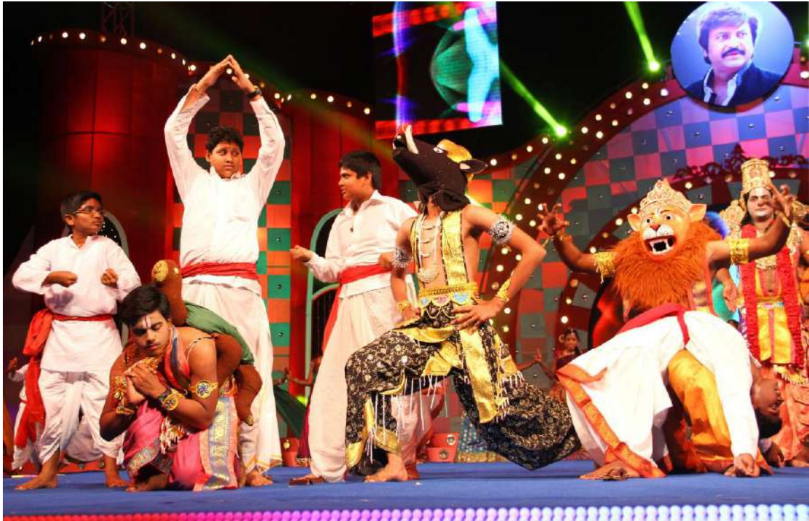
Students showcasing their cultural talents