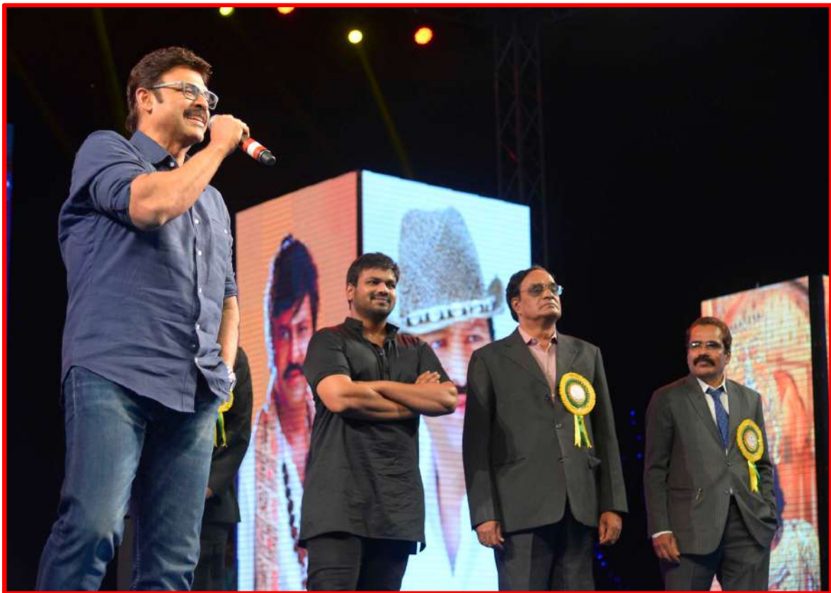
Chief Guest Sri Daggupati Venkatesh, Movie Artist enthralled the audience with his mesmerising message

The evening was made more colourful with an array of cultural programmes - Classical dance, Western dance, Skit, Jugal Bandhi, and many songs that kept echoing in the minds of the people even as they carried memories of the day back home.