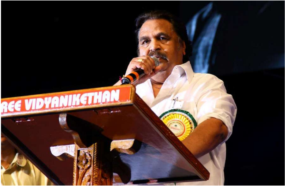
Darshakarathna Dr. Dasari Narayana Rao addressing the gathering