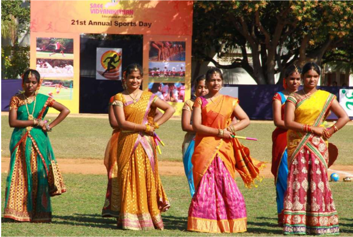
The Colorful Cultural Events by Students