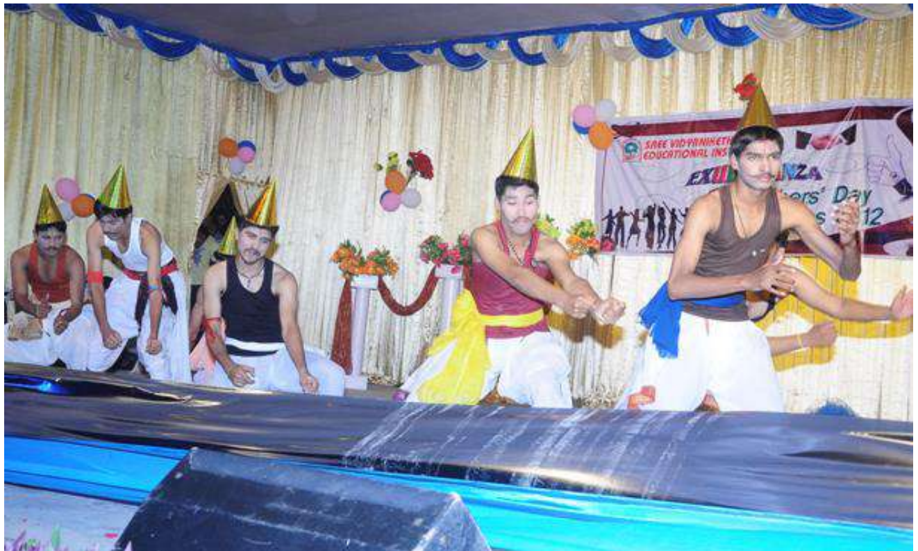
Students exhibiting their artistic talents