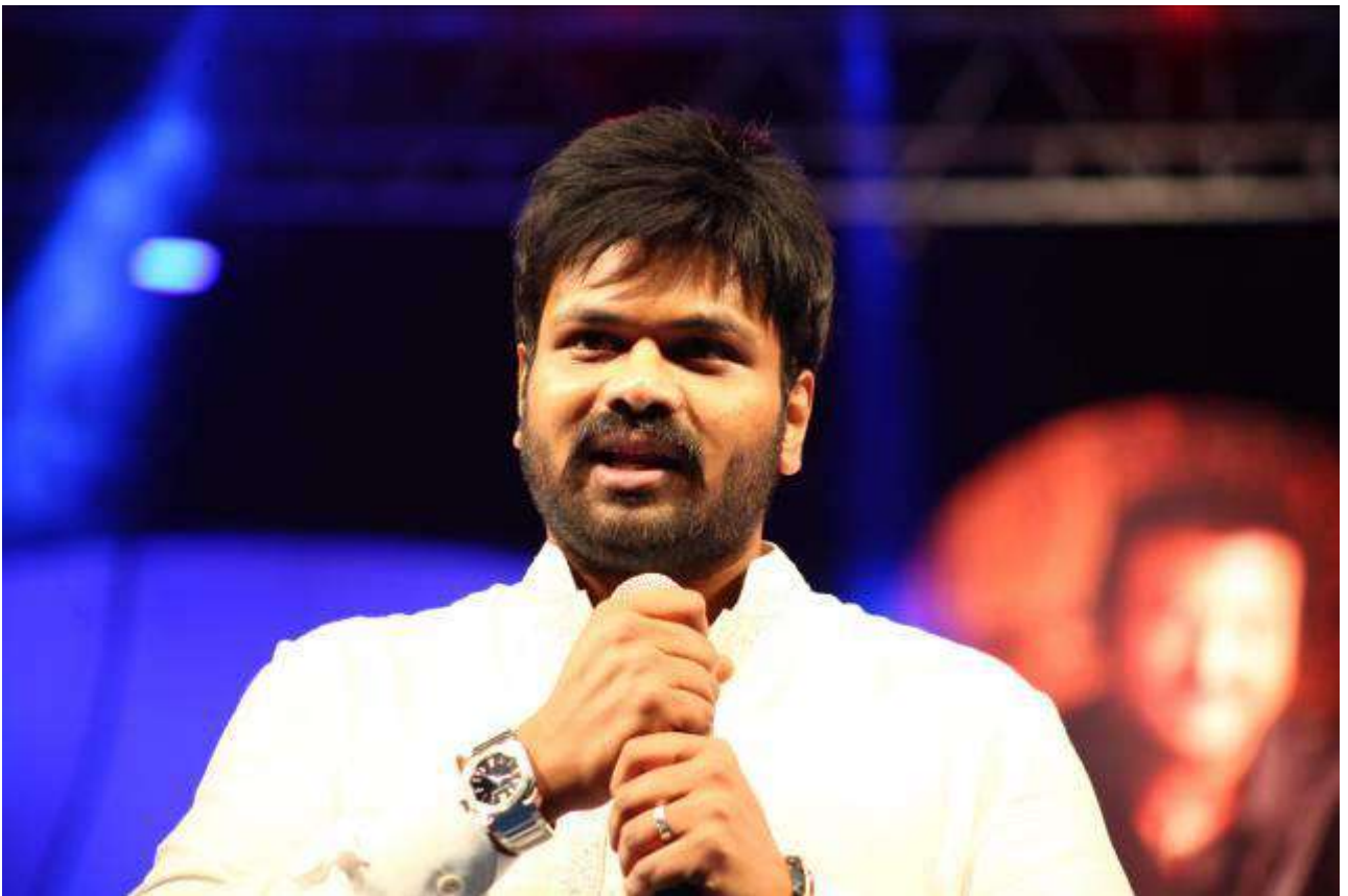
Sri Manoj Manchu entertaining the mammoth gathering