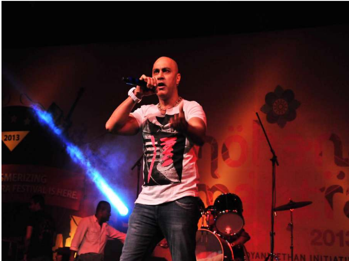
Mr. Baba Sehgal entertaining the audience