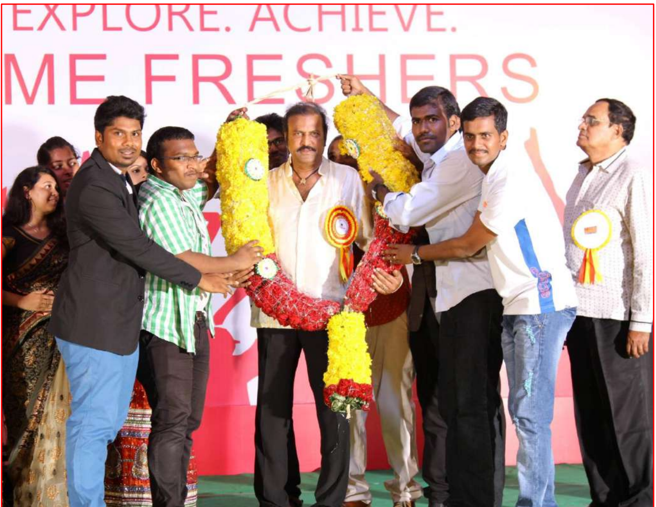
Hon'ble Chairman felicitated by the students