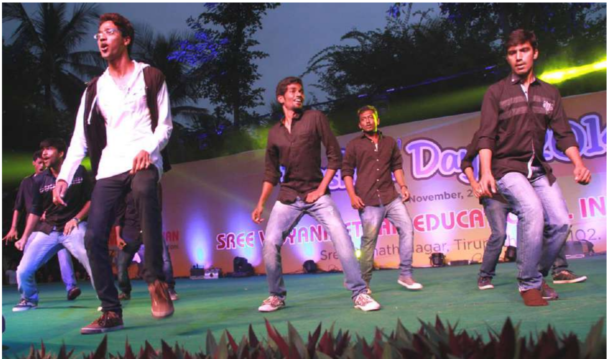
Students exhibiting their artistic talent