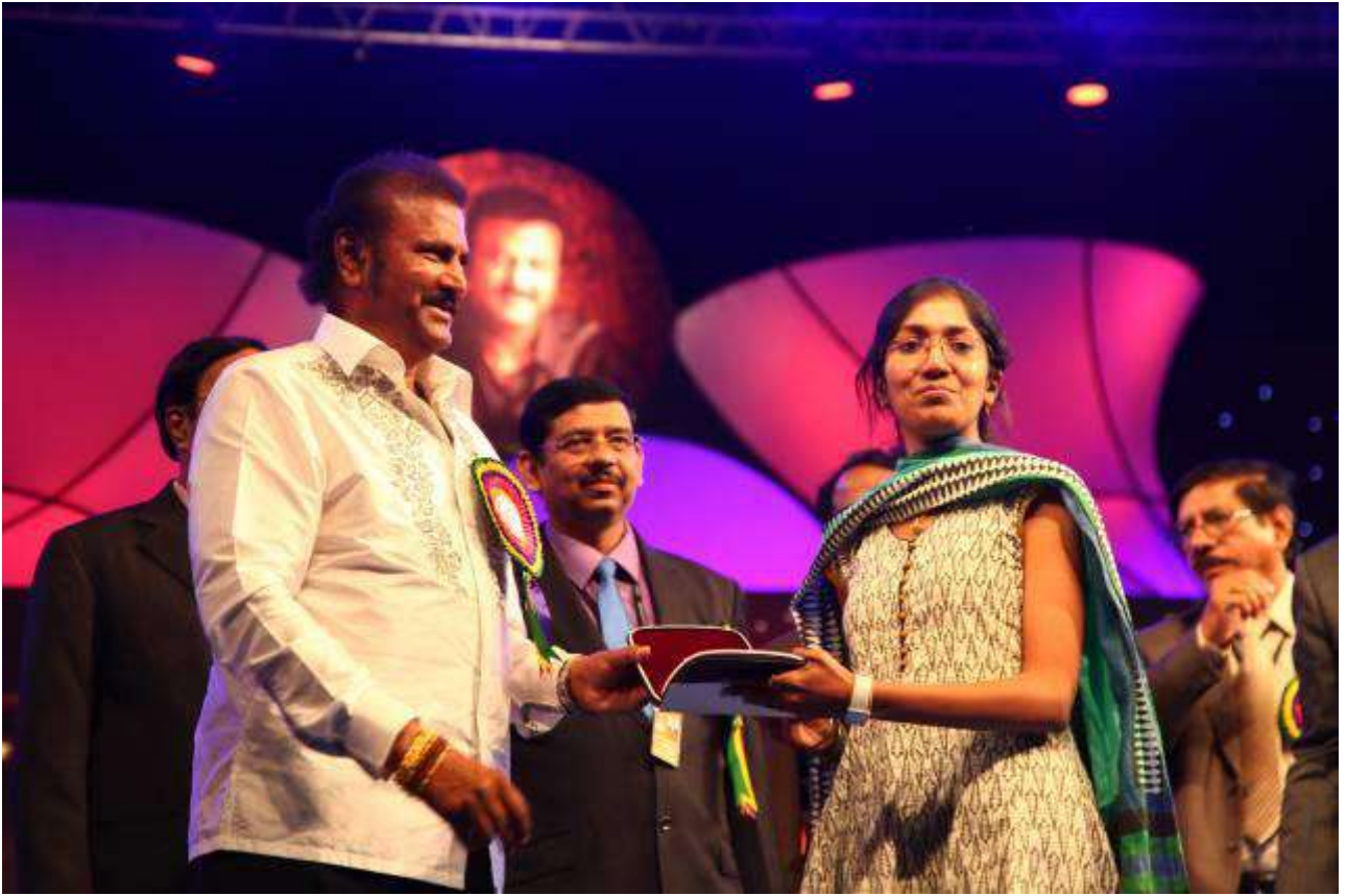
Hon'ble Chairman presenting gold medal to the topper