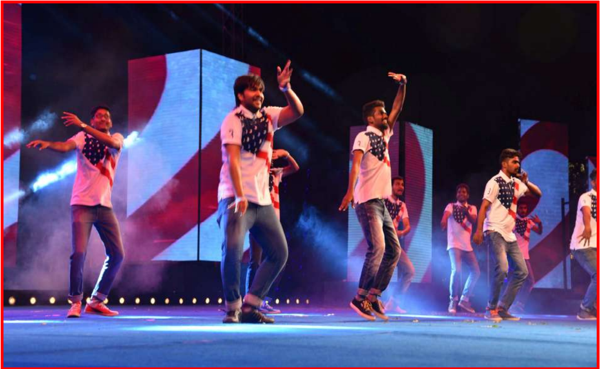
Dance performance by Students