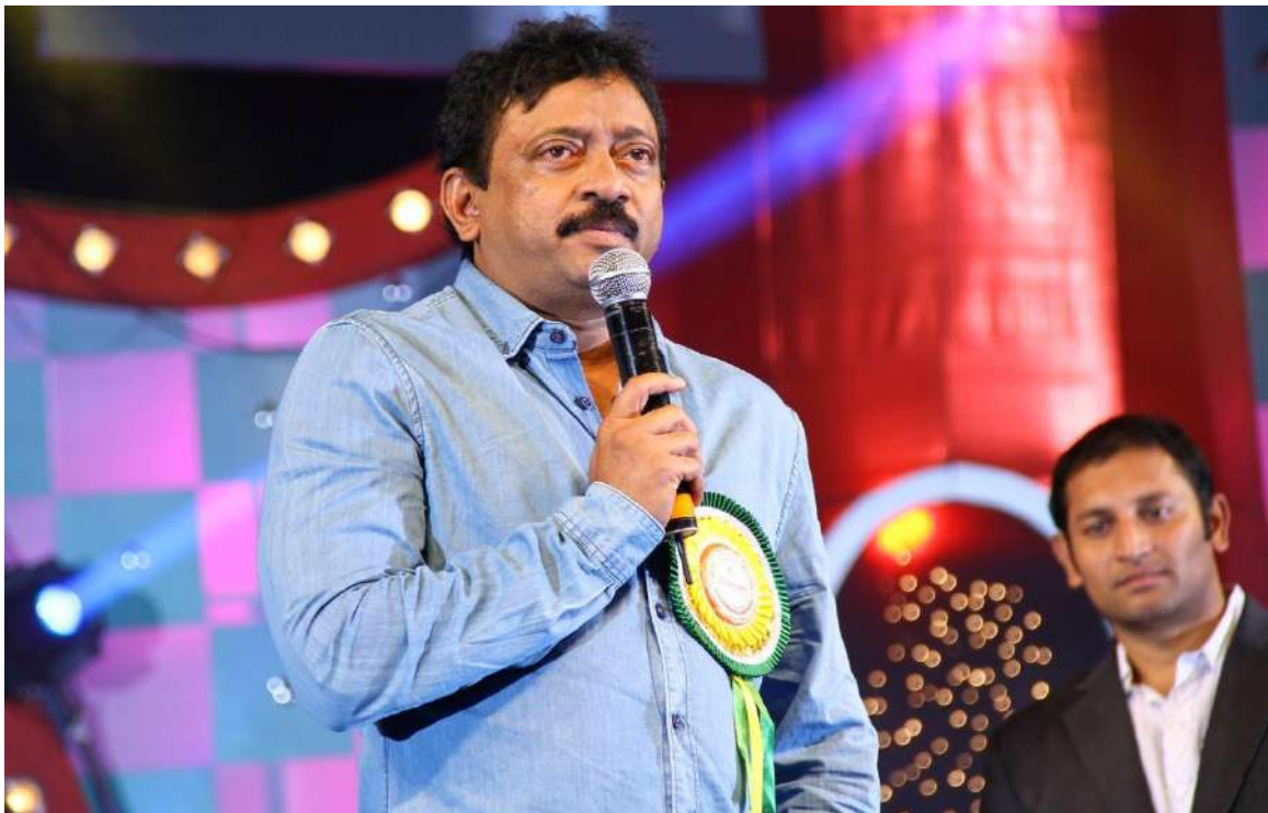
Sri Ram Gopal Varma, versatile Film Director & Producer addressing the gathering