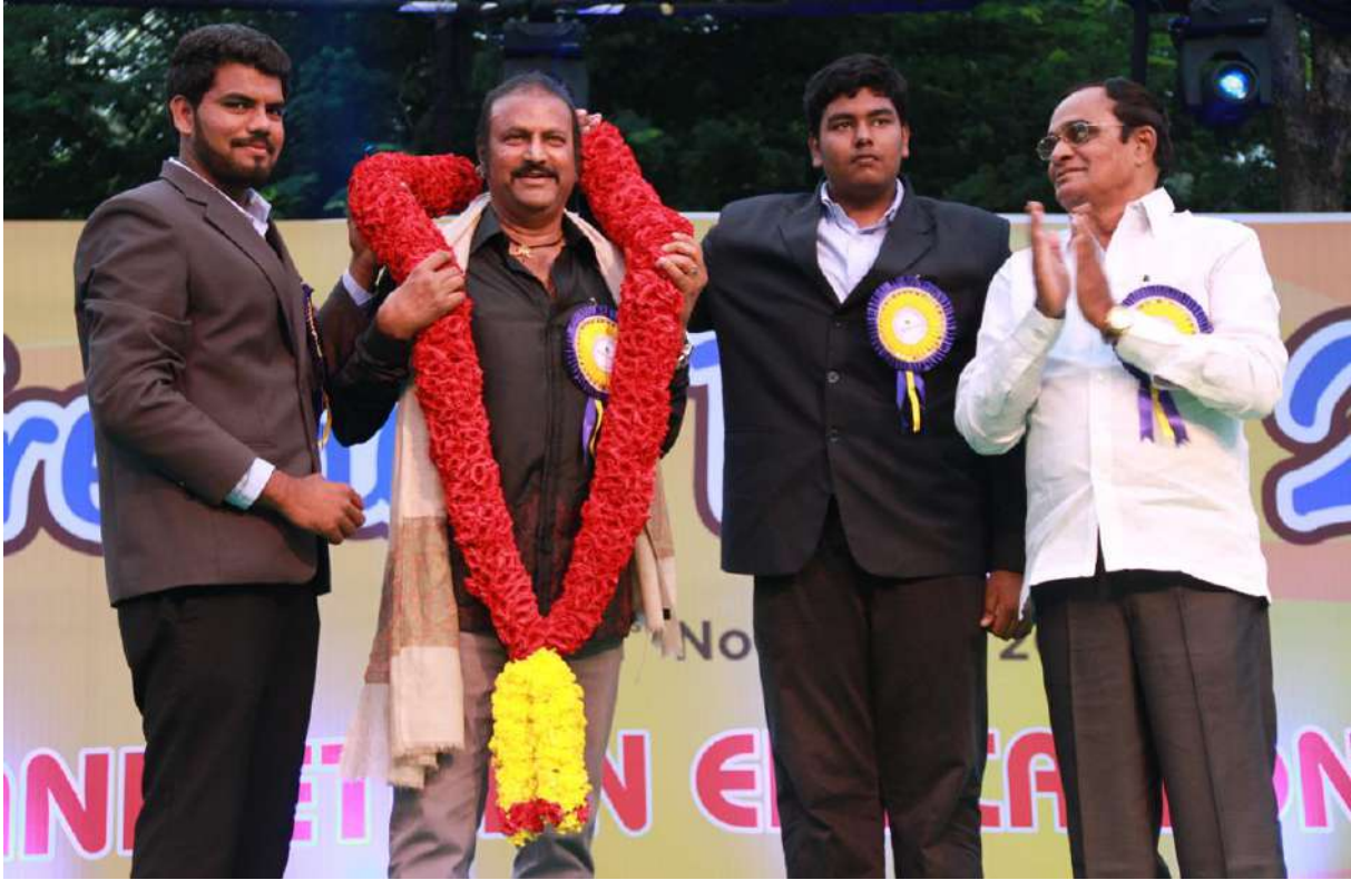
Felicitation to Hon'ble Chairman Dr. M. Mohan Babu by the Students