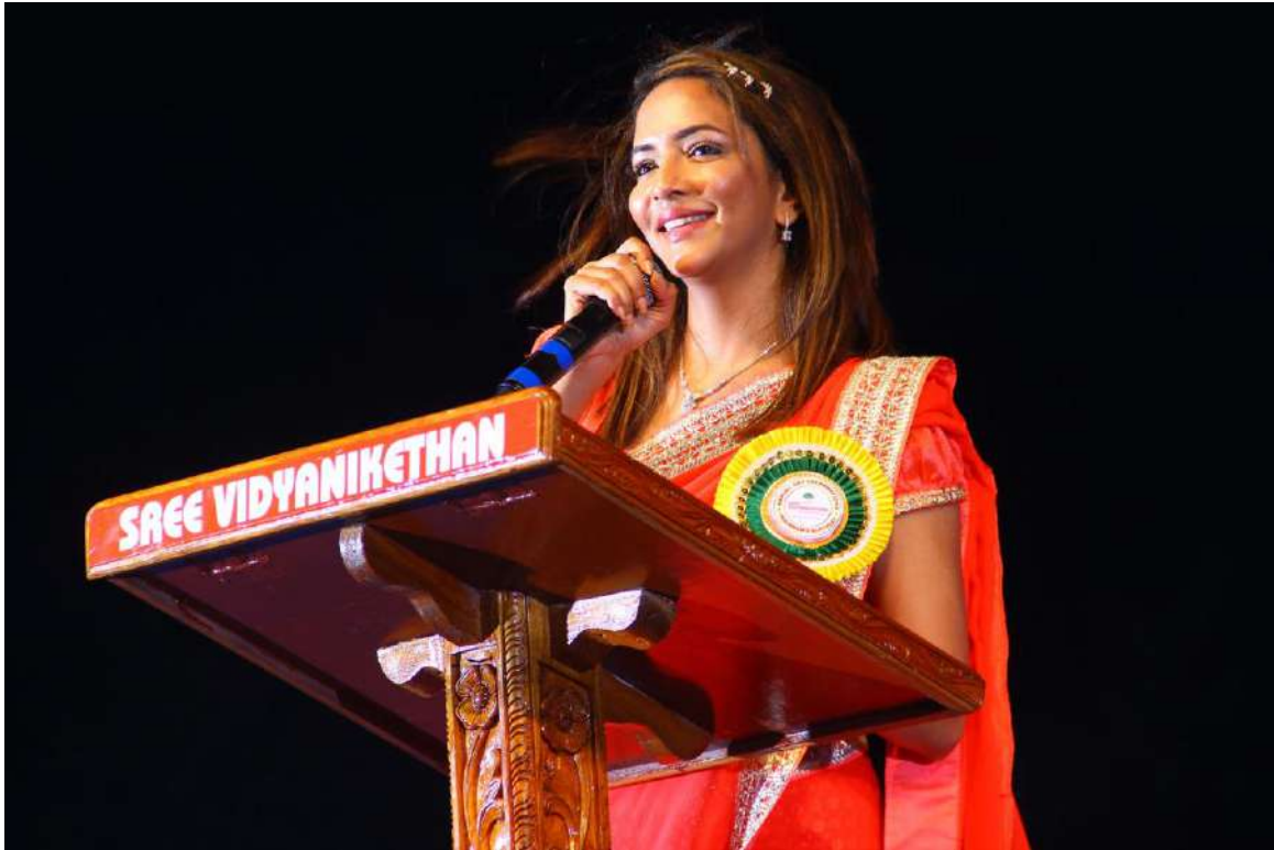
Ms. Lakshmi Manchu, Popular film artiste and Producer sharing lighter moments with the gathering