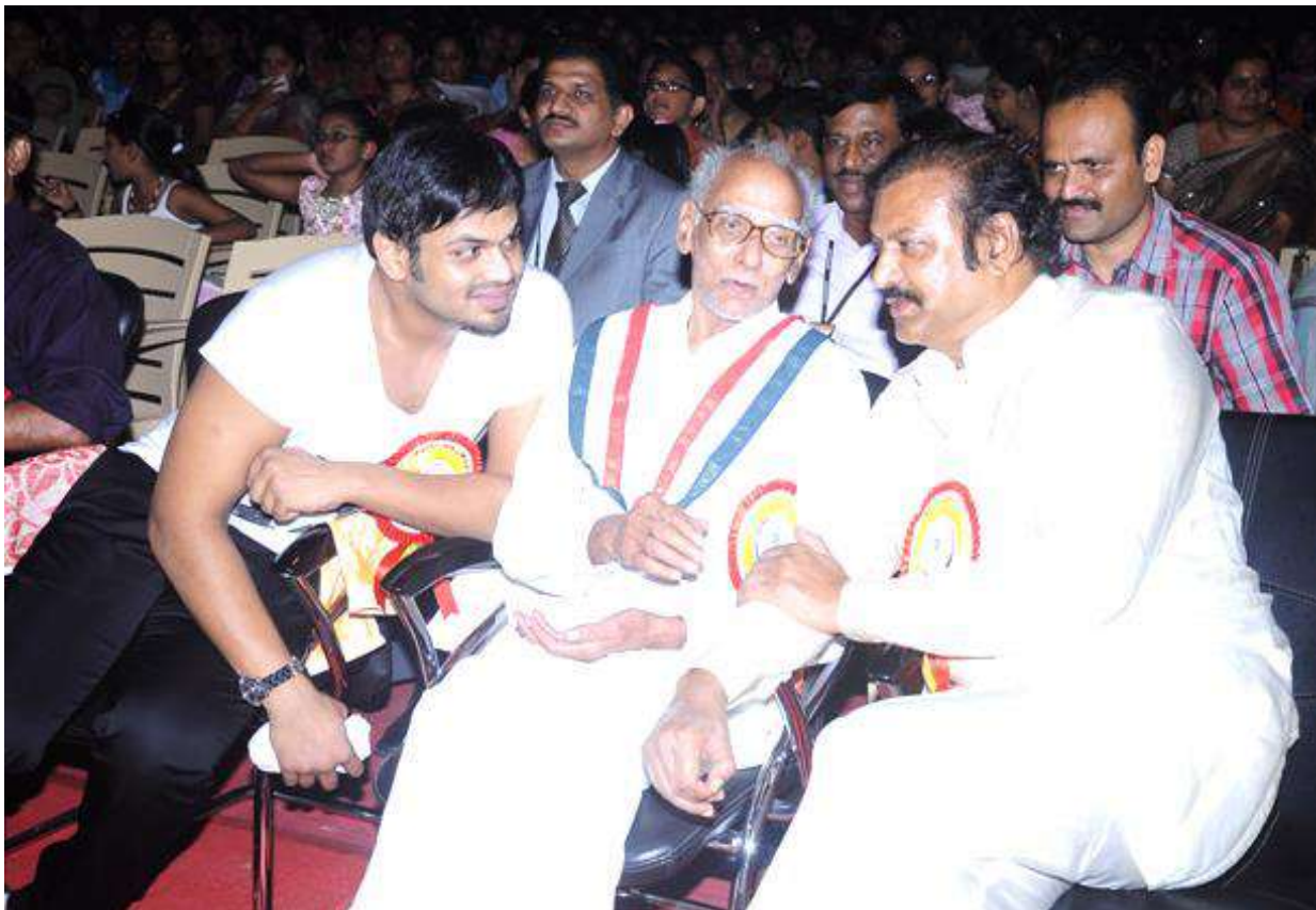
Kal Aaj Aur Kal: the inspiring trio of SVET