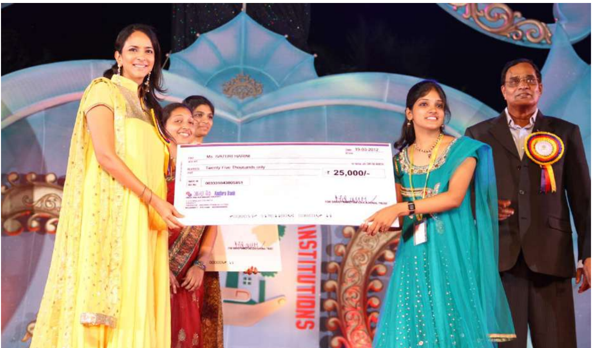
Padma Shri Dr. M. Mohan Babu Kala Peetham cash award of Rs.25,000/- to the finalists of Paadutha Teeyaga by Ms. Lakshmi Manchu