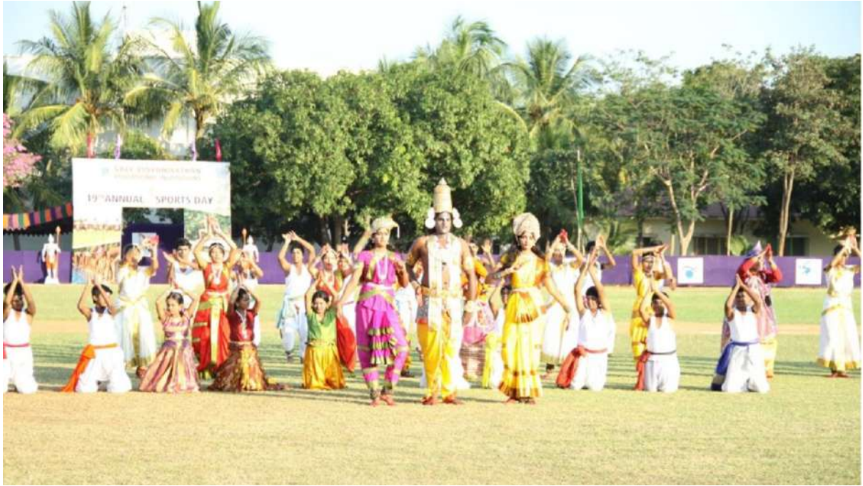
The Colorful Cultural Events by Students