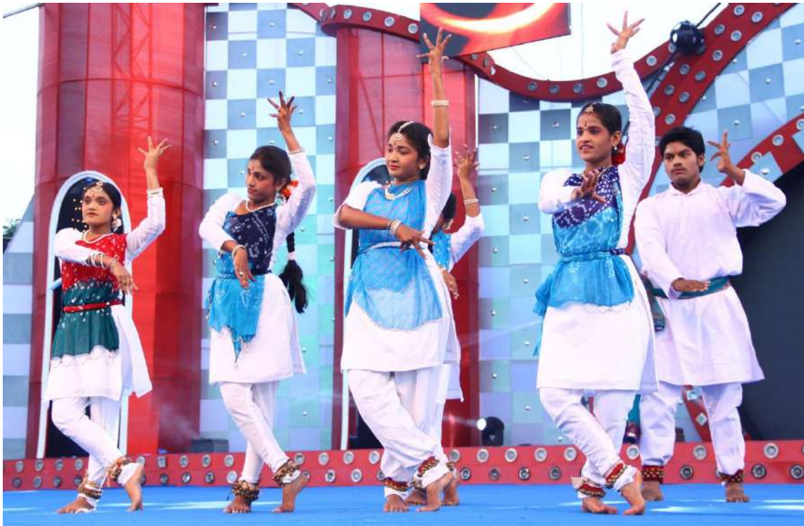
Classical Dance by students