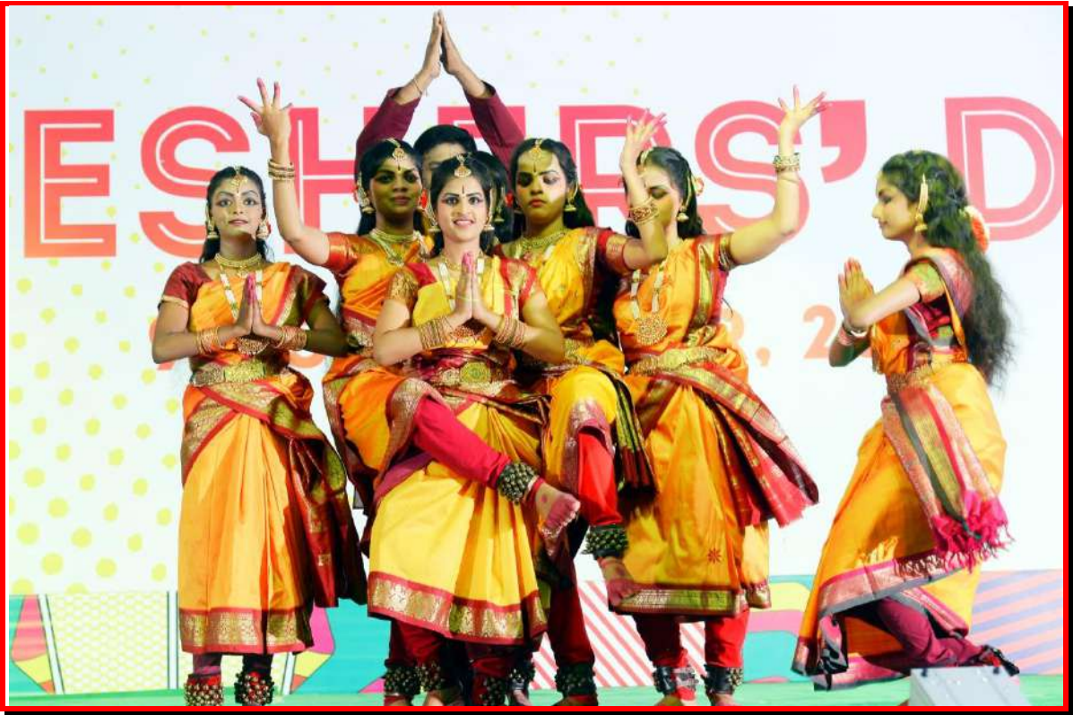
A Classical dance by the students