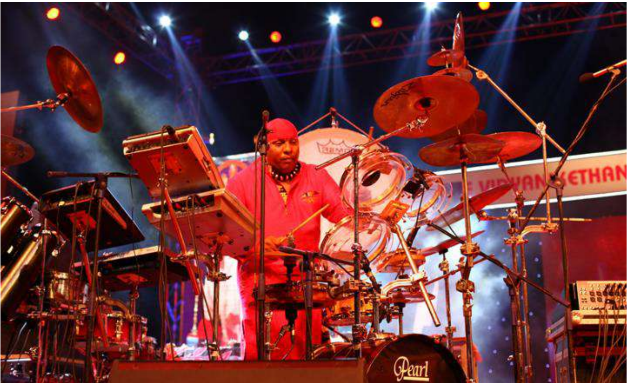
Sri Anandan Siva Mani, famous percussionist playing the instruments