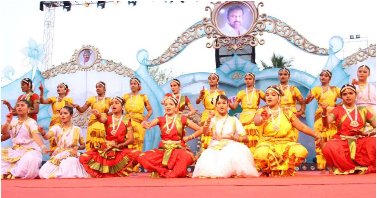
Cultural Programme by Students