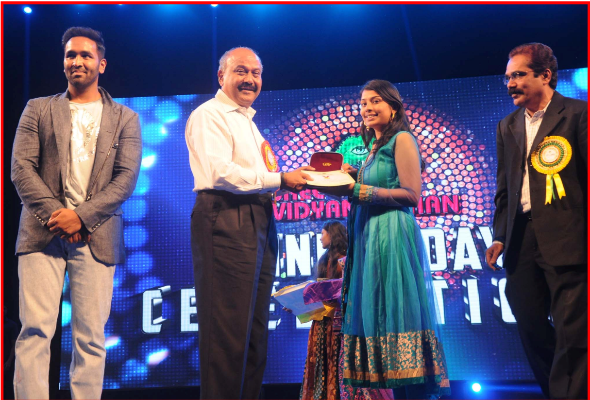
Chief Guest awarding the Gold Medal to the Topper