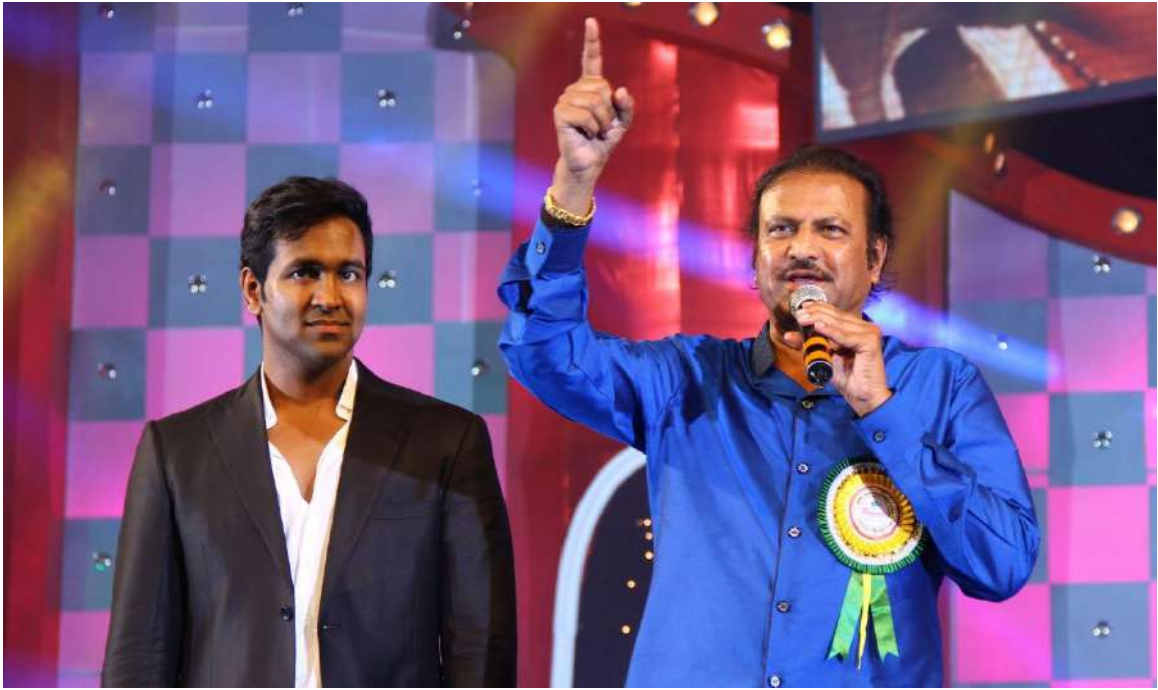
Sri Vishnu Manchu, CEO and Dr. M. Mohan Babu, Chairman, SVET magnetize the attention of the gathering