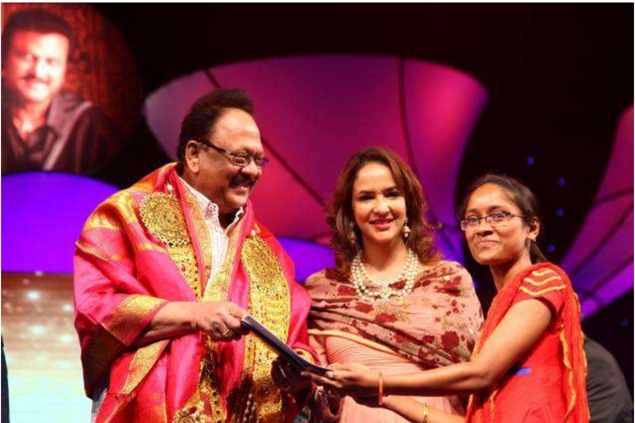
Sri U.V. Krishnam Raju presenting the gold medal while Ms. Lakshmi Manchu looks on