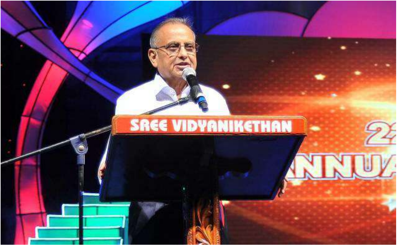
Chief Guest Prof. P. Rama Rao addressing the gathering