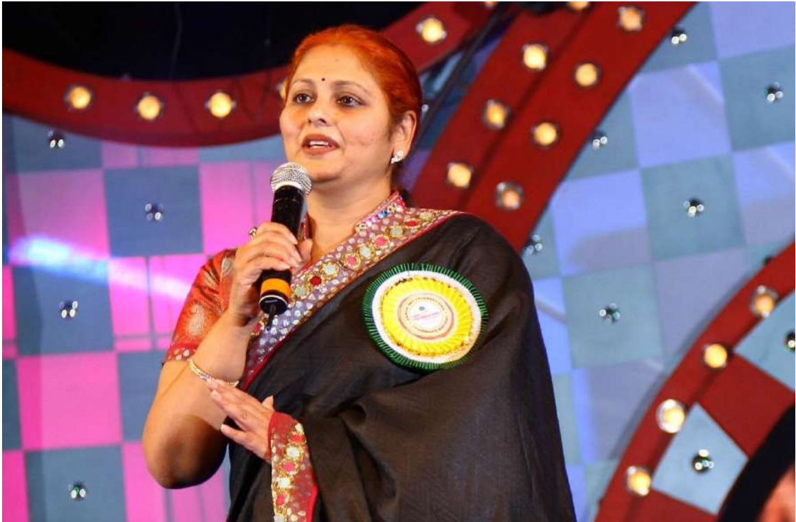
'Sahaja Nati' Smt. Jayasuda, renowned Film Artiste addressing the gathering