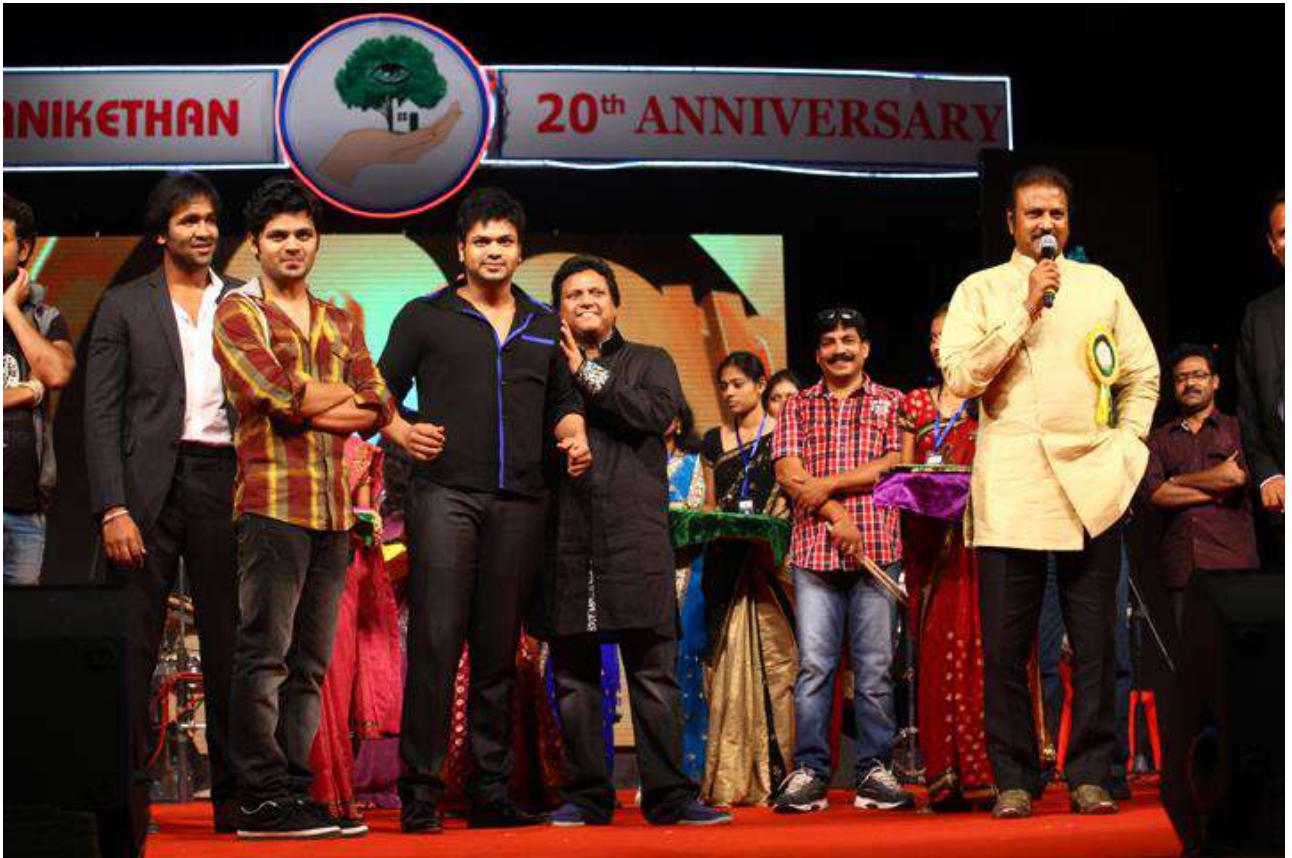
Padma Shri Dr. M. Mohan Babu, Chairman, SVET addressing the gathering