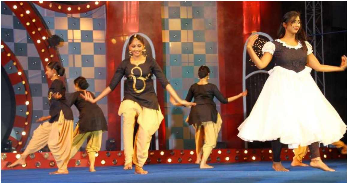
Fusion Dance by professionals