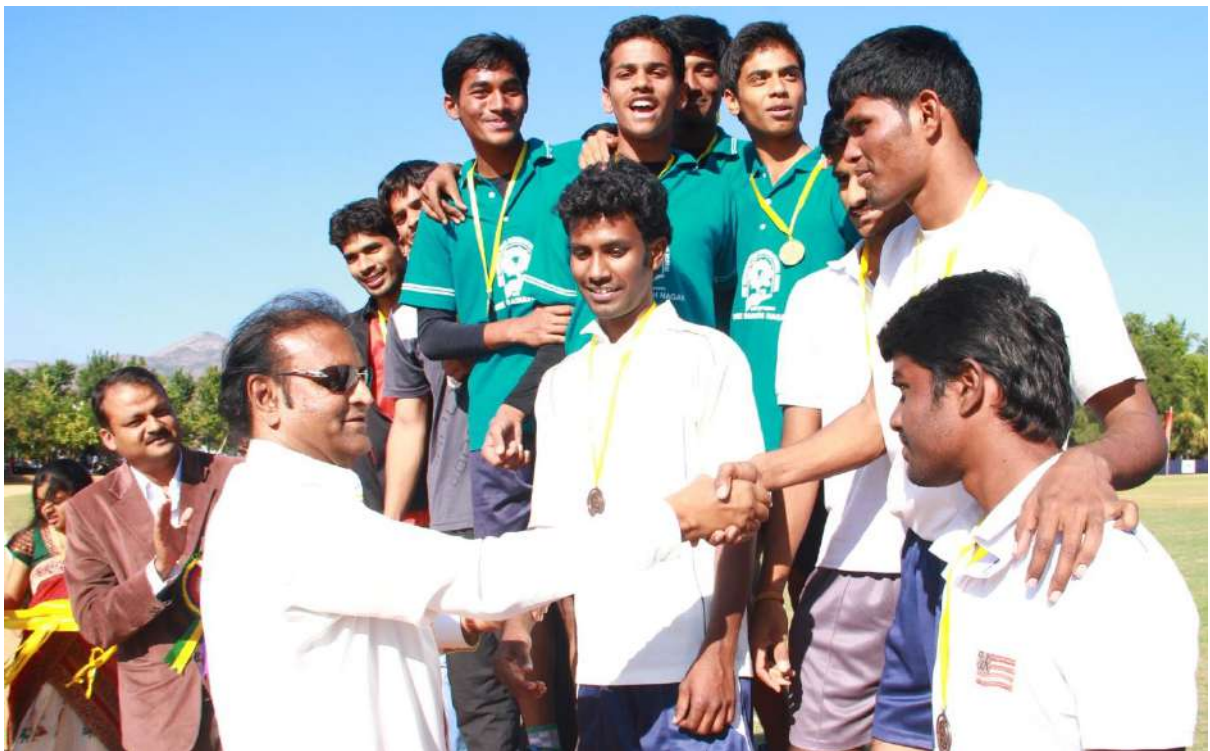
Dr. M. Mohan Babu, Chairman, SVEI congratulating the winners