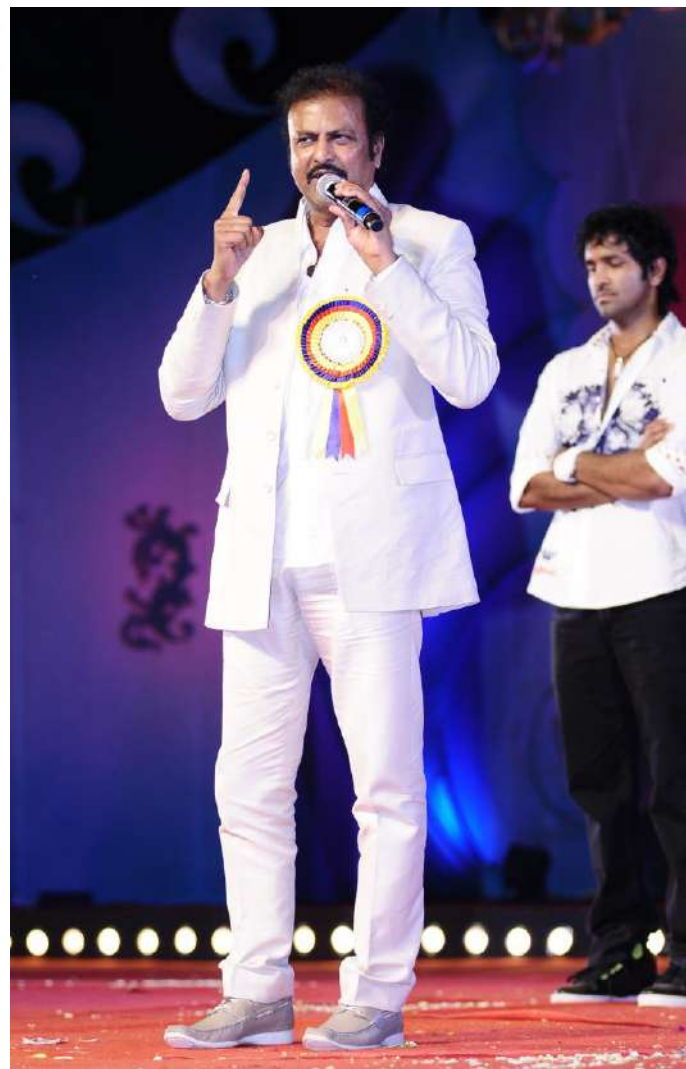
Padma Shri Dr. M. Mohan Babu, Chairman, SVET addressing the gathering