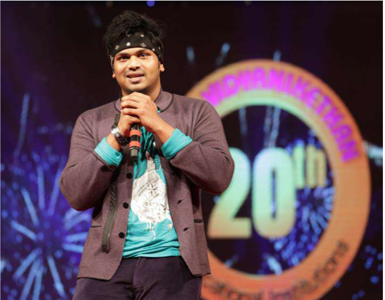
Sri Manoj Manchu, Film Artiste reverberating the audience