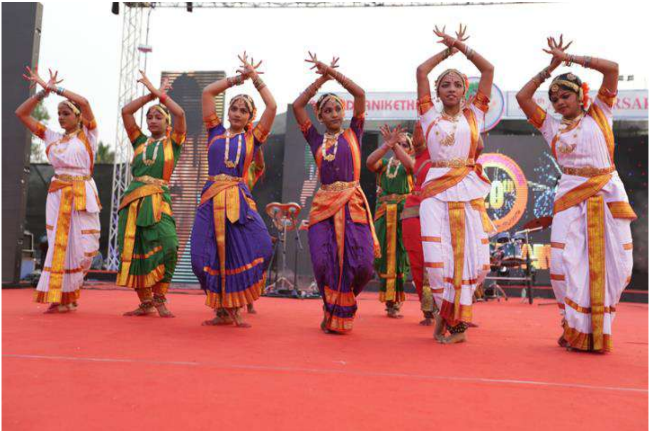
Dance Programme by Students