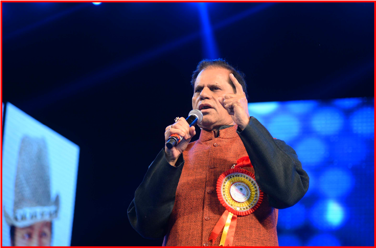
Guest of Honour, Dr. T.Subbarami Reddy, Member of Parliament (Rajya Sabha) electrified the gamut of audience with his enlightening speech.