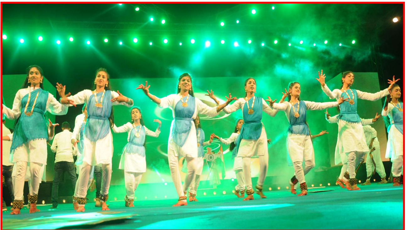
Captivating Dance performance by the Students