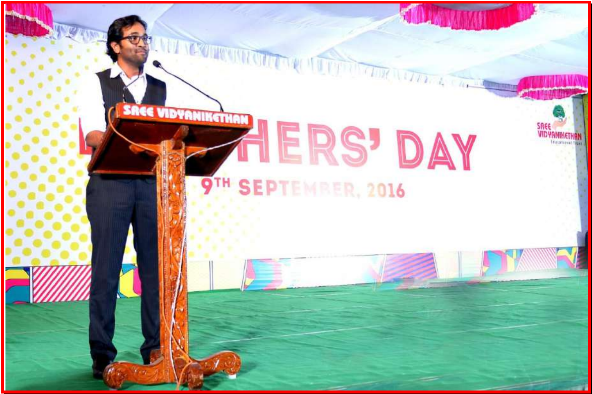
Chief Guest of Sri Vishnu Manchu enlightening the jubilant students