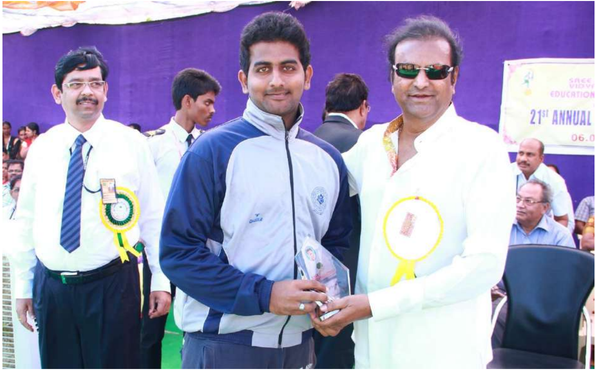
Dr. M. Mohan Babu, Chairman, SVEI distributing the prizes