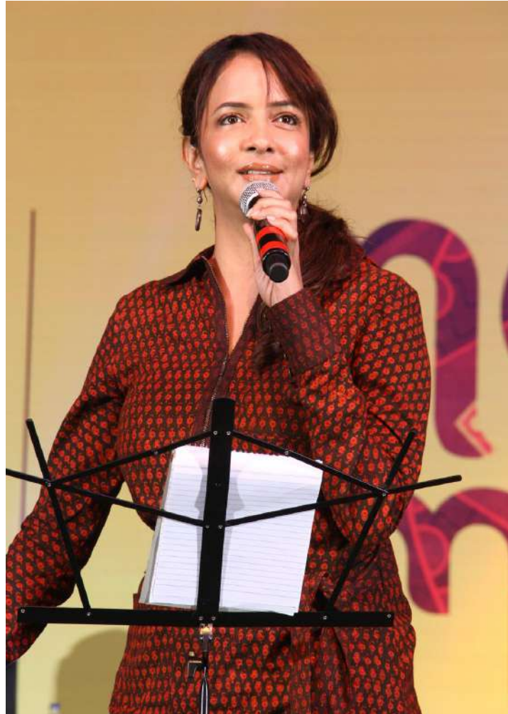
Ms. Lakshmi Manchu, Film Artiste & Producer inspiring the gathering