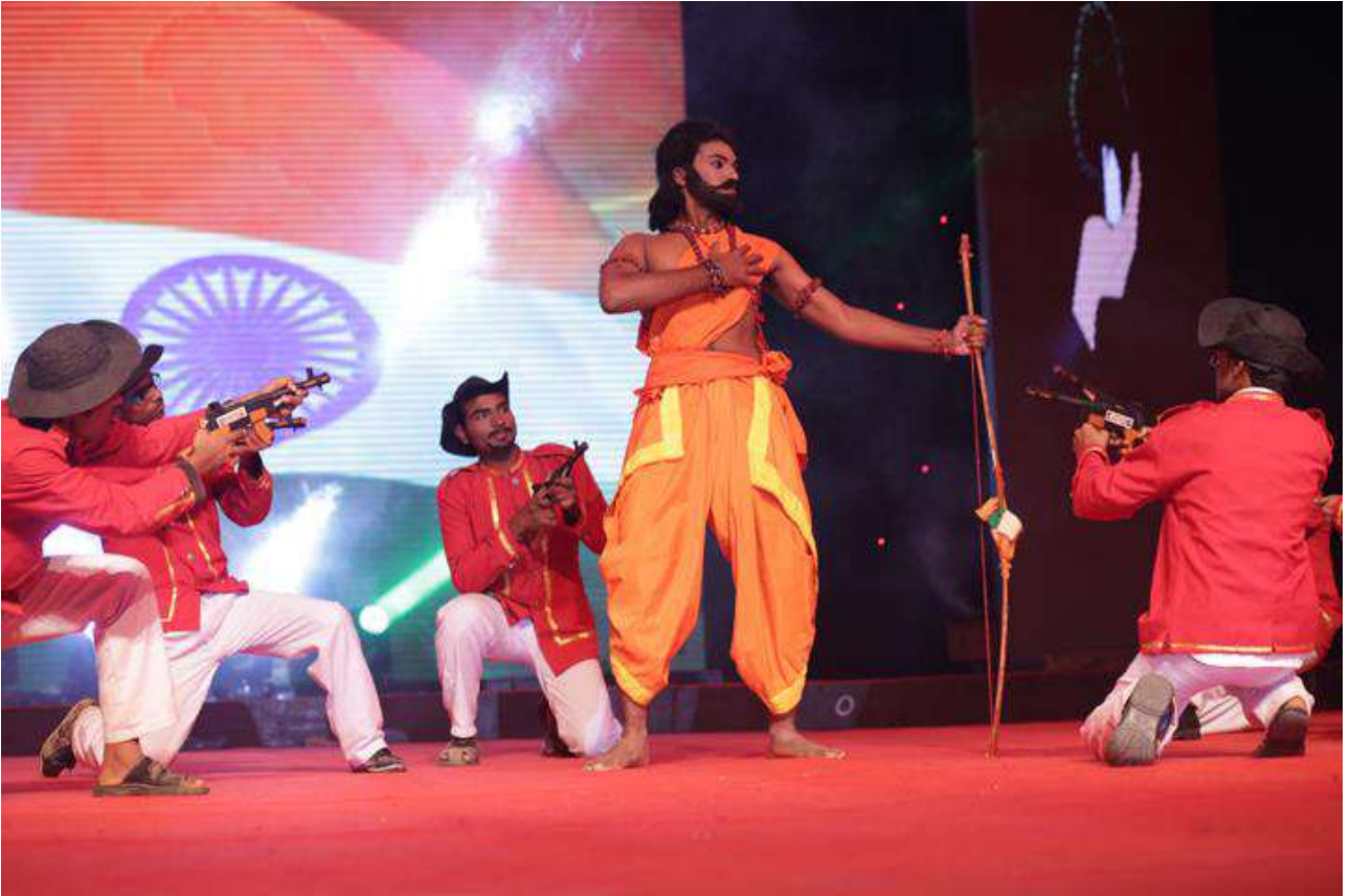
Skit by Students