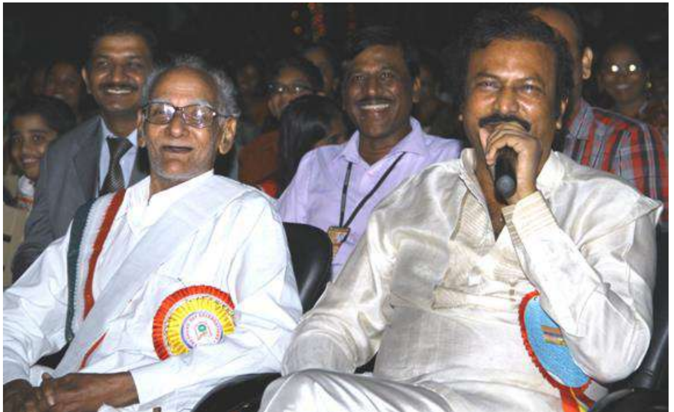
Chairman sharing Joyous moments with the audience