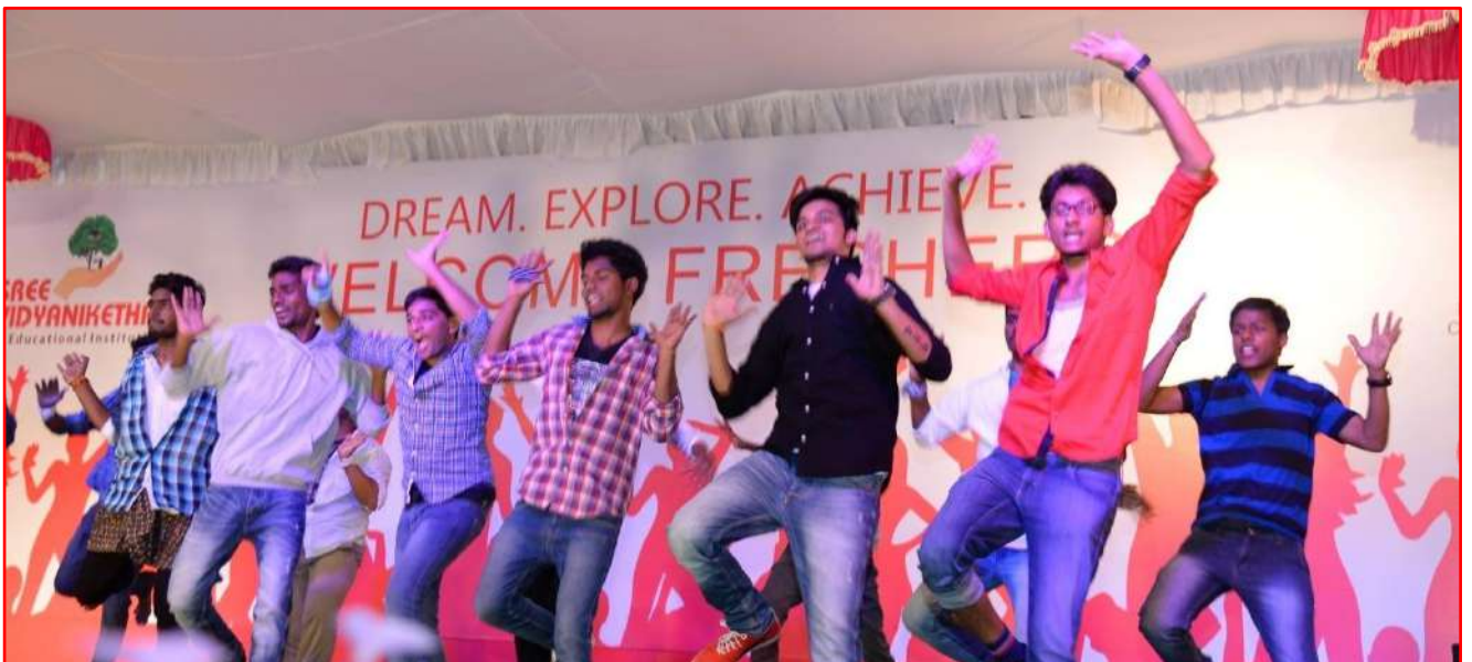
Students exhibiting their artistic talent