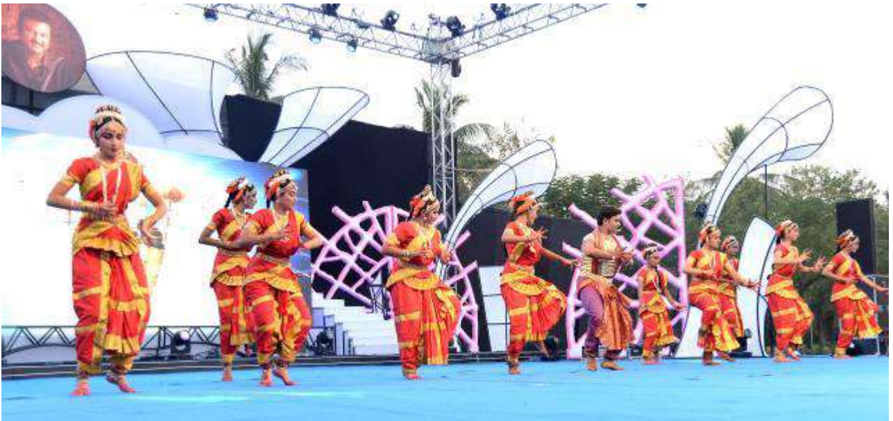
A Classical dance by the students.