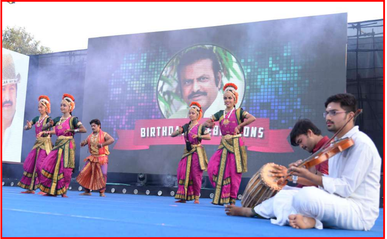
Classical performance by Students