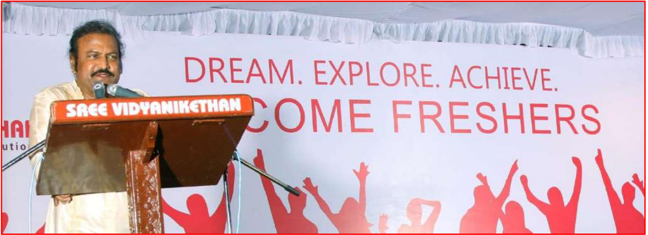
Hon'ble Chairman Dr. M. Mohan Babu addressing the jubilant students