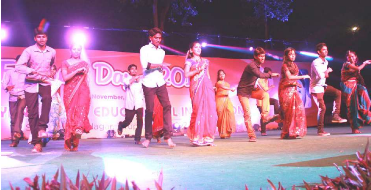
A dance item by the students