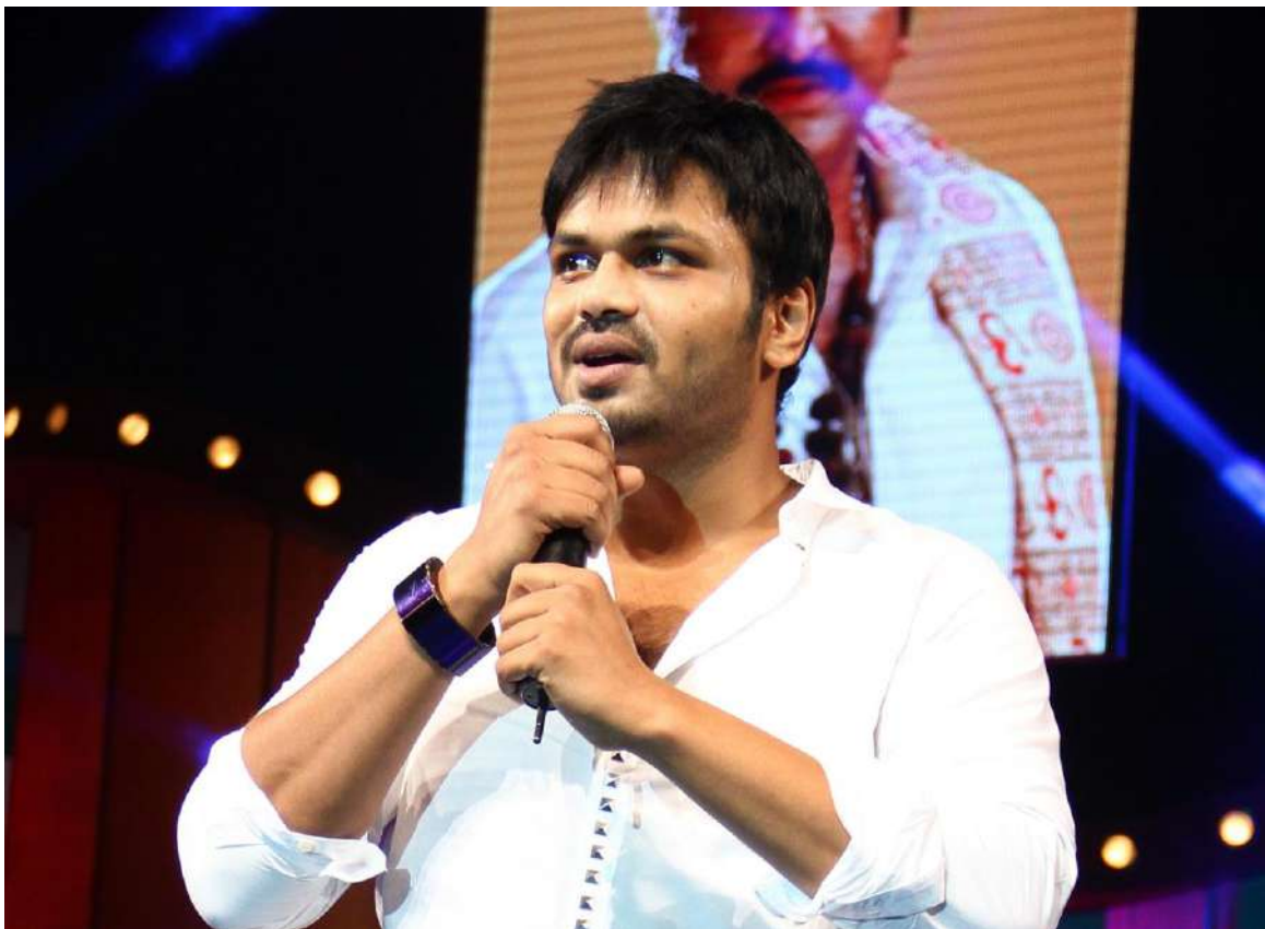
Sri Manoj Manchu, Film Artiste capturing the attention of the gathering