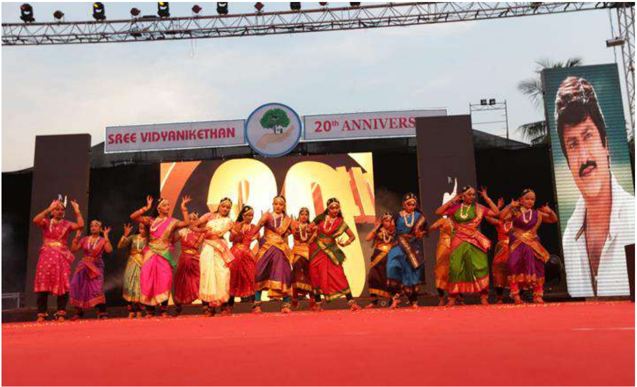
Dance Programme by Students