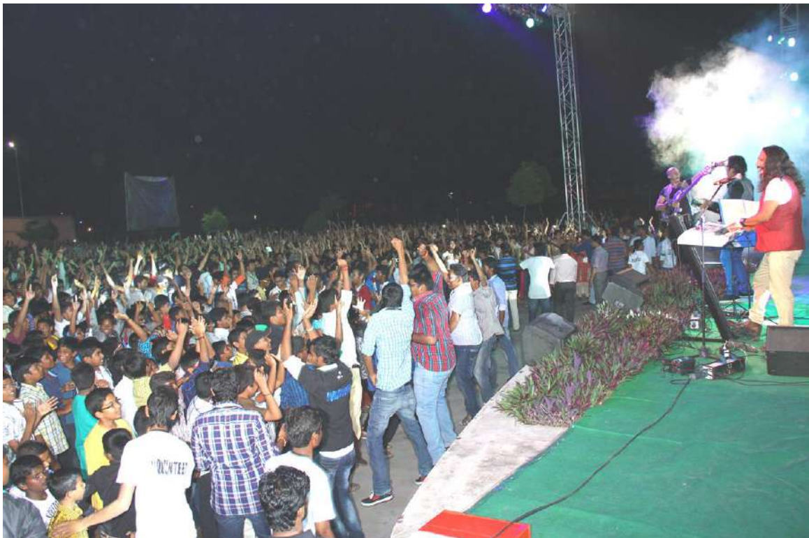
Musical Night Performance by EKA Music Band, New Delhi