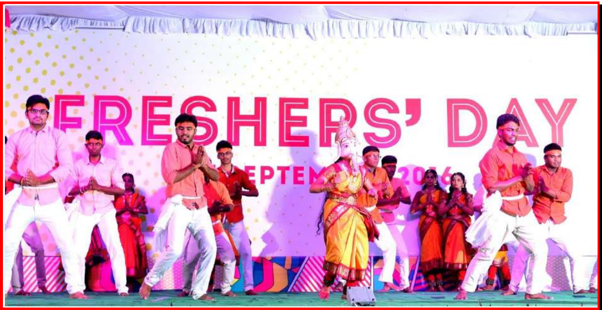
Students exhibiting their artistic talent