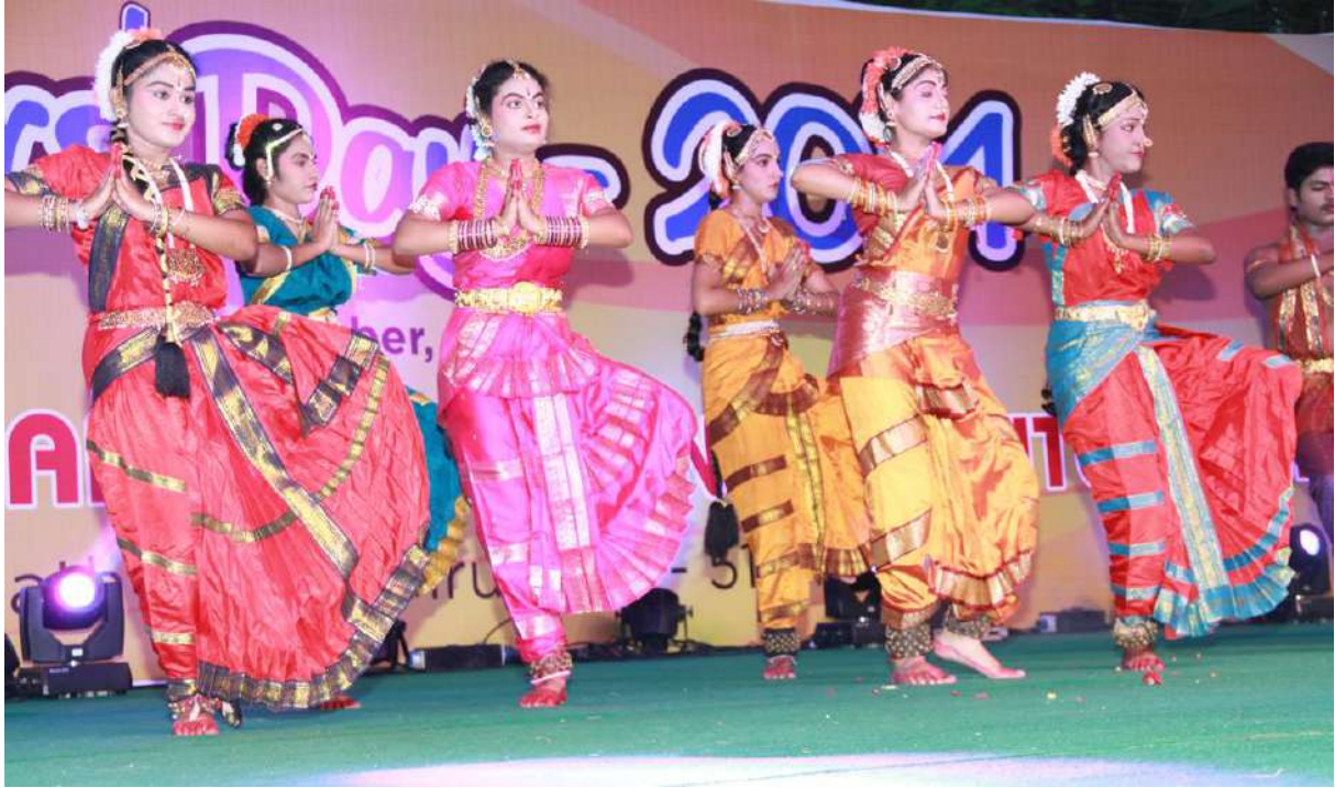
A classical dance performance by the students