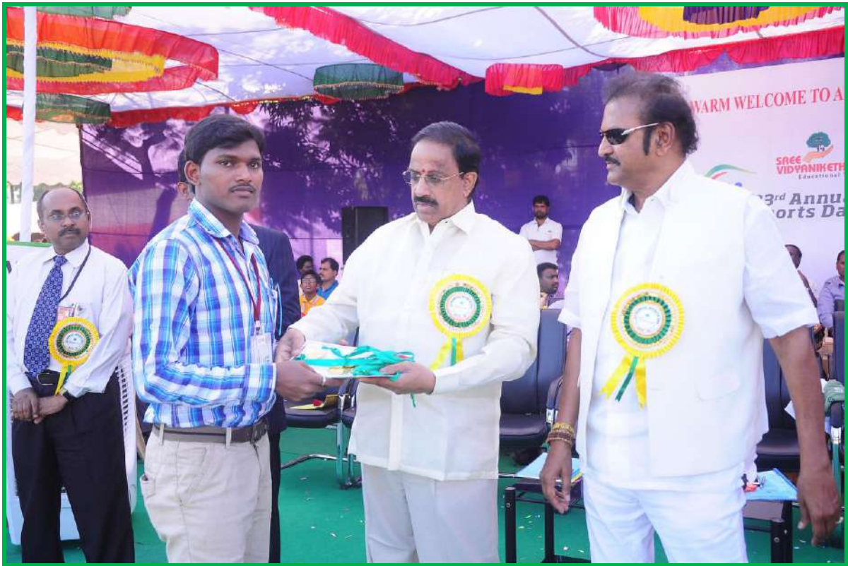
Sri Tummala Nageswara Rao & Dr. M. Mohan Babu presenting the awards