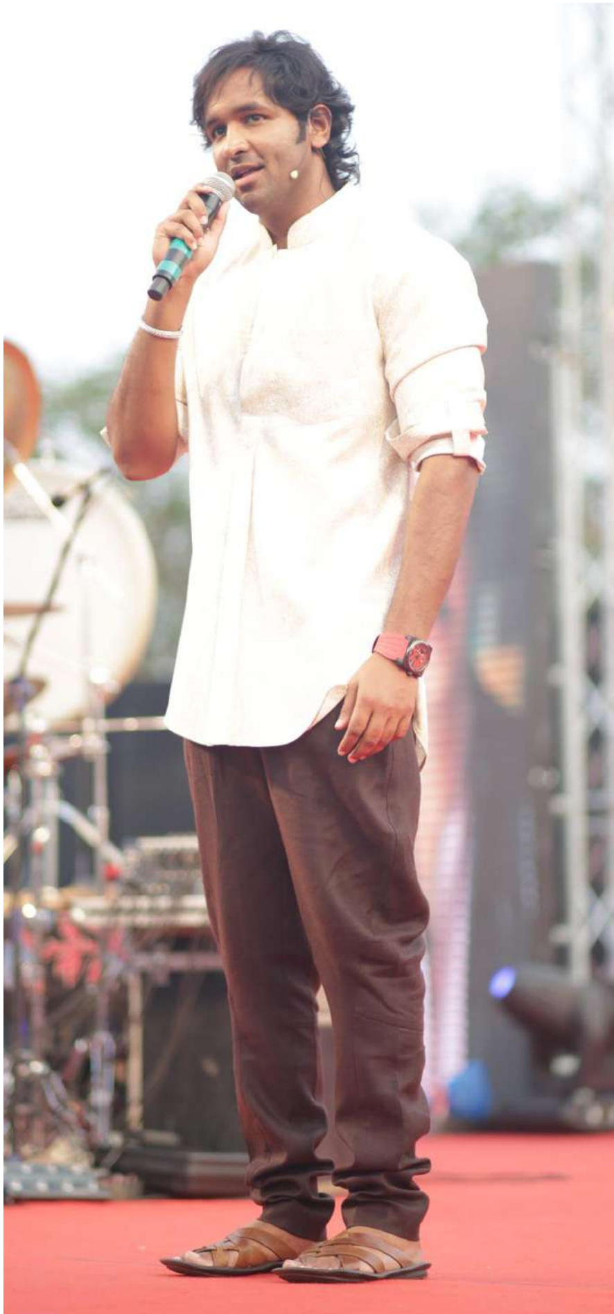
Sri Vishnu Manchu, Chief Executive Officer, SVET addressing the gathering