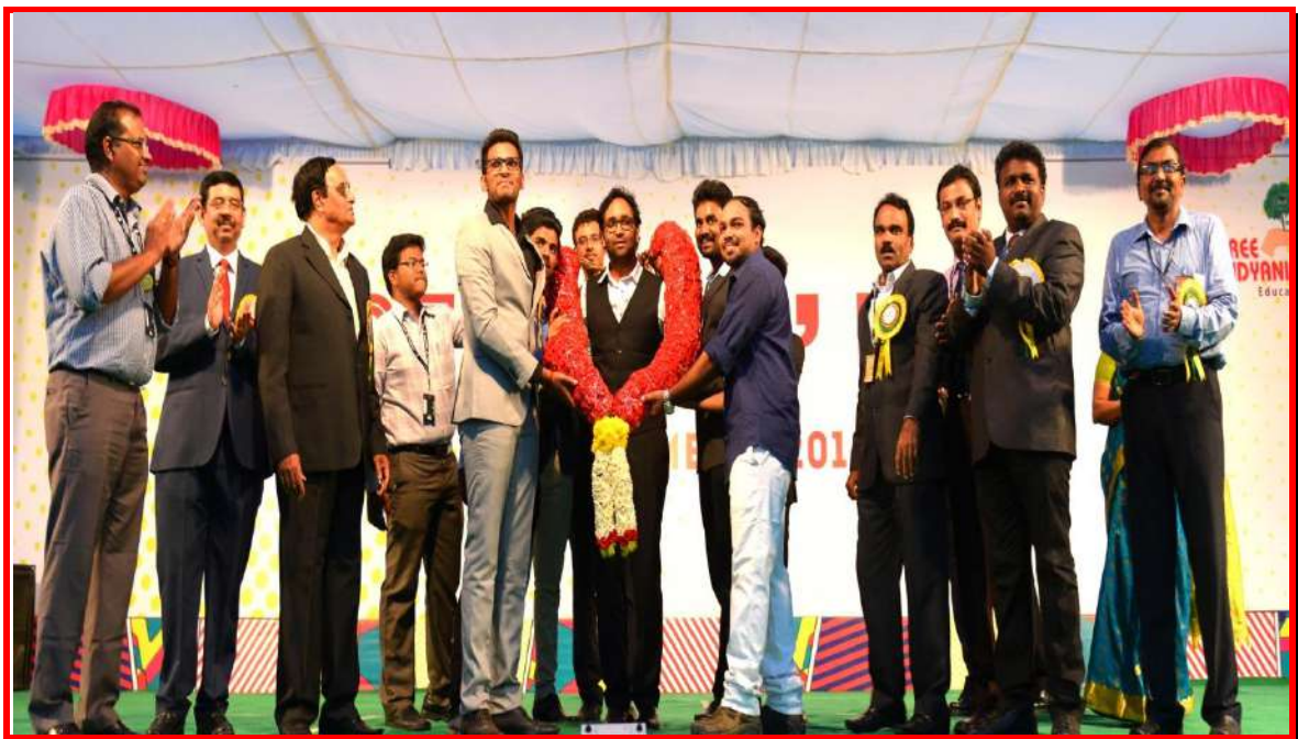
Chief Guest of the function felicitated by the students and dignitaries

The presence of Principals and Heads of Department of SVET Institutions; faculty members and scores of students added dignity and festive atmosphere to the celebrations which was further enriched by cultural events 'dances and skits' presented by the students. The celebrations concluded with eventful programmes by students.