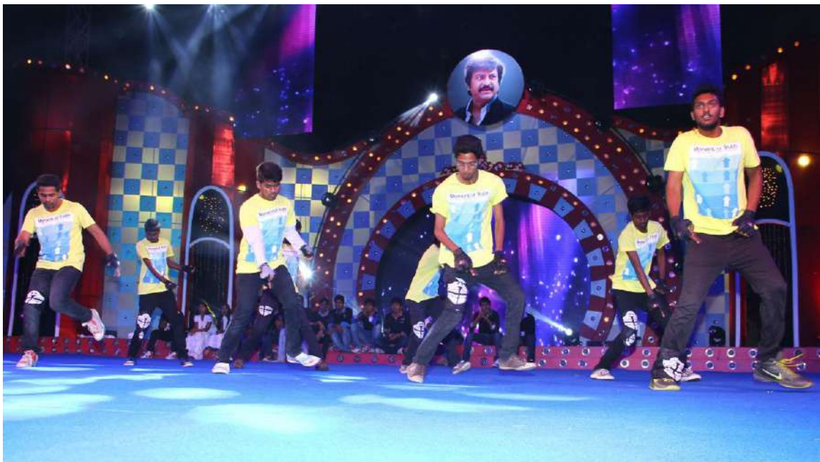
Students performing an intricate cultural event