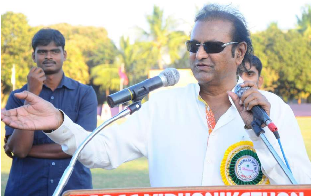
Dr. M. Mohan Babu, Chairman, Sree Vidyanikethan Educational Institutions addressing the gathering.