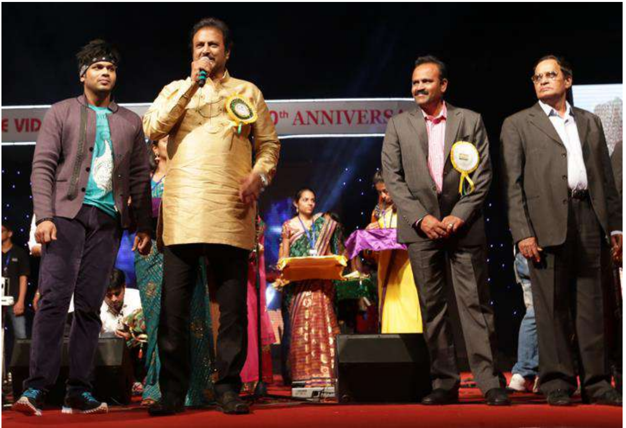
Padma Shri Dr. M. Mohan Babu, Chairman, SVET addressing the gathering