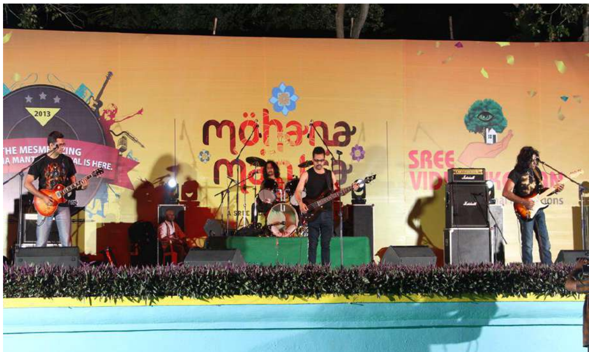
Heavens Down Band's reverberating performance