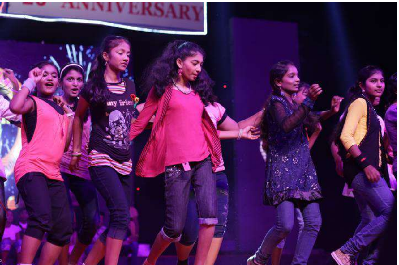
Dance Programme by Students