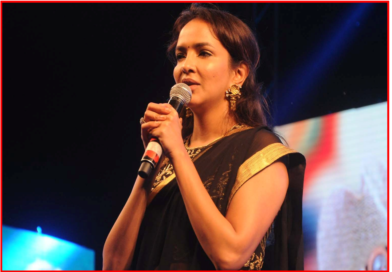
Ms. Lakshmi Manchu, Popular film artiste and Producer advising the students