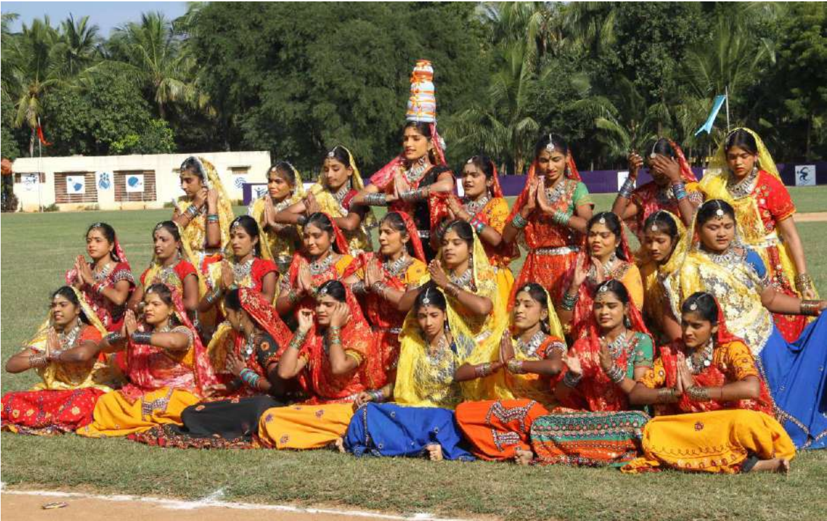
The Colorful Cultural Events by Students