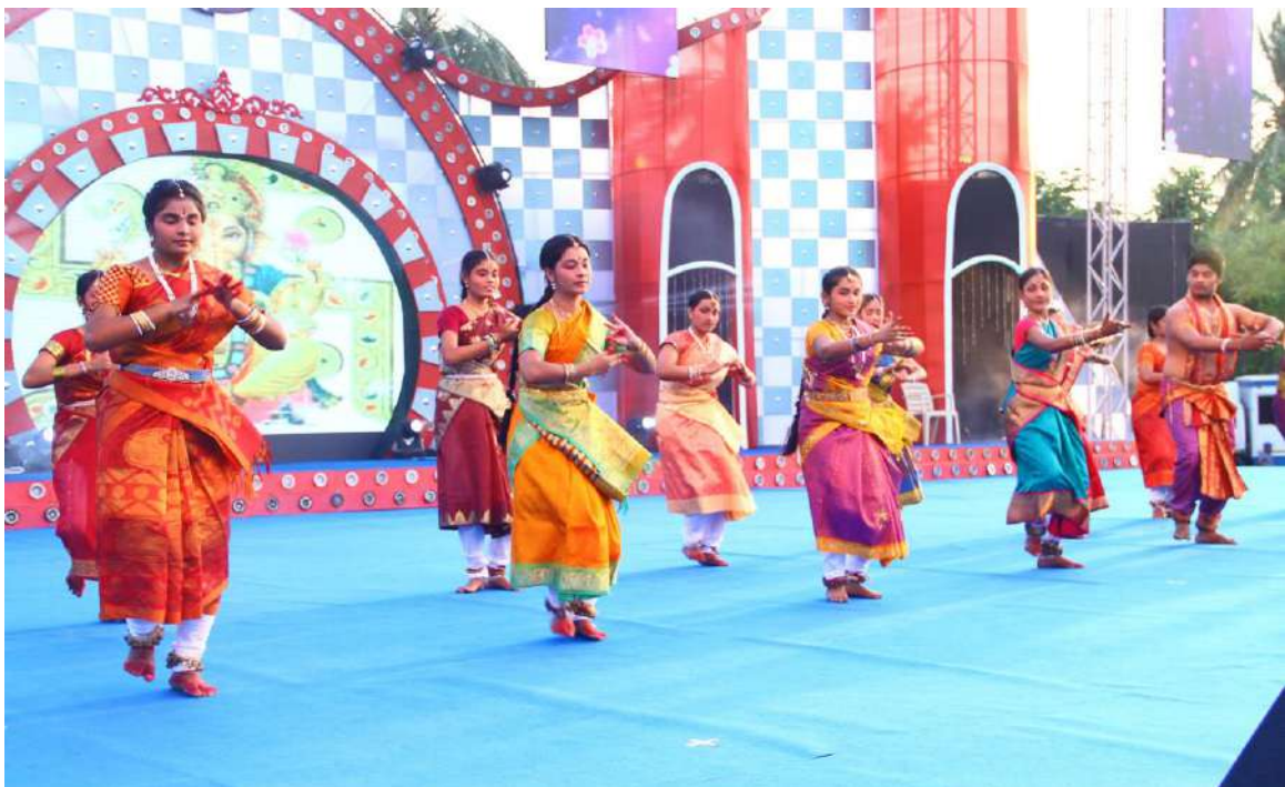
Students presenting a cultural event