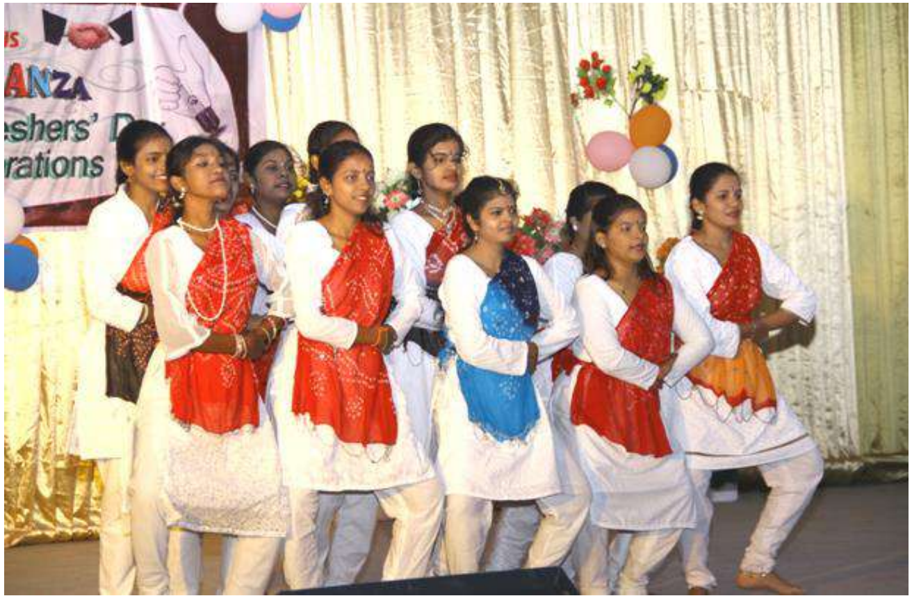
A dance item by students