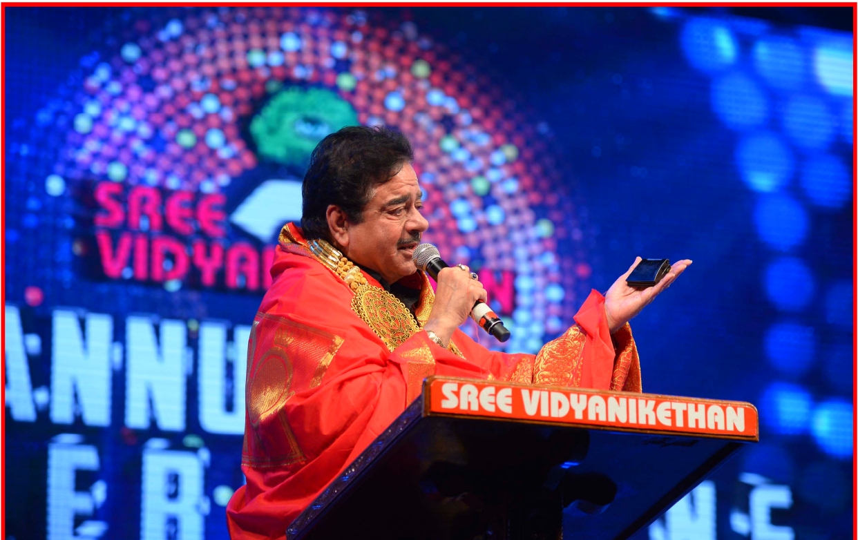
Special Guest Sri. Shatrughan Sinha, Movie artiste and Member of Parliament sharing his invaluable experience