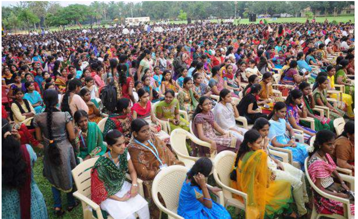
Girls excelling the boys in enjoying the celebrations