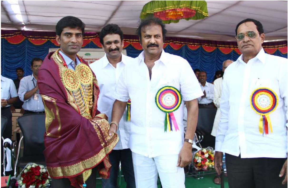
Padma Shri Dr. M. Mohan Babu, Chairman, SVET felicitating the Chief Guest