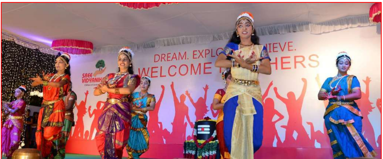
A Classical dance by the students