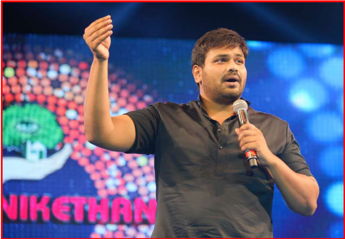
Sri Manchu Manoj, Movie Artiste motivating the elated audience