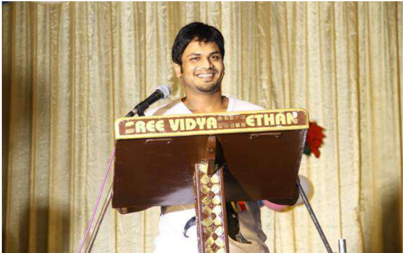
Chief Guest Sri Manchu Manoj Kumar, Film Artist addressing the jubilant students