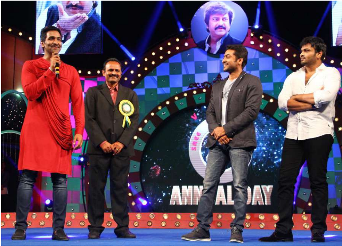
Sri Vishnu Manchu, Chief Executive Officer, SVET enthusing the gathering