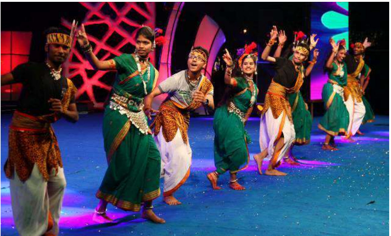
A tribal dance by the students