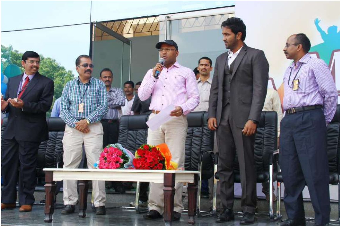
Chief Guest declaring the Technical Fest open