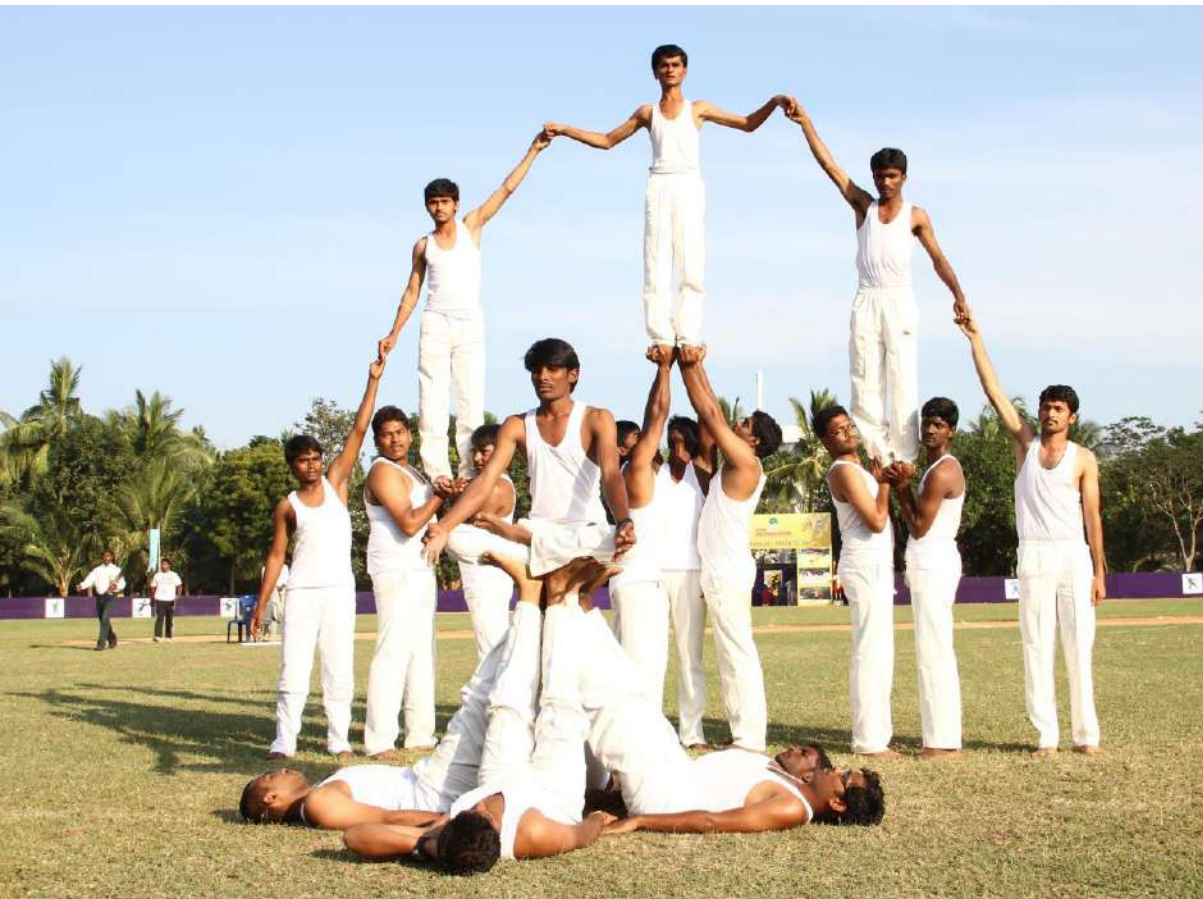
Students displaying their acrobatic skills