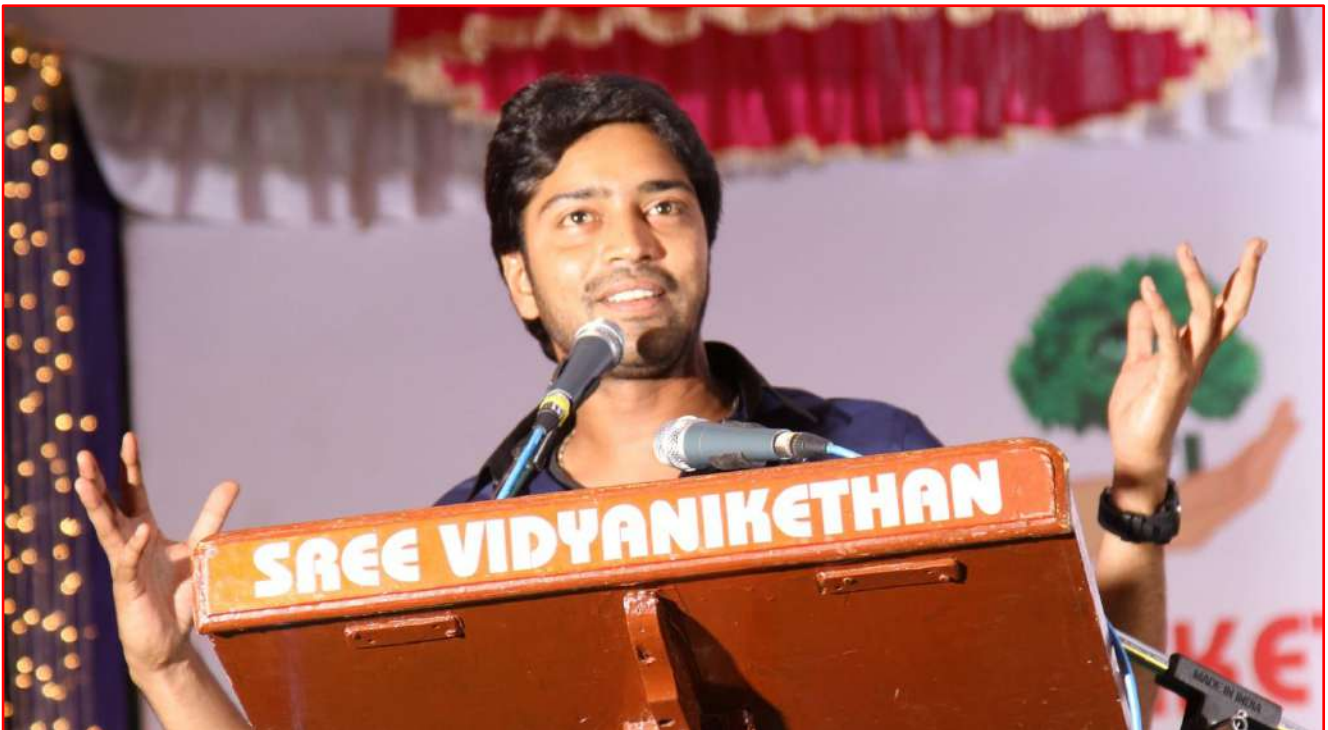
Sri Allari Naresh entertaining the mammoth gathering