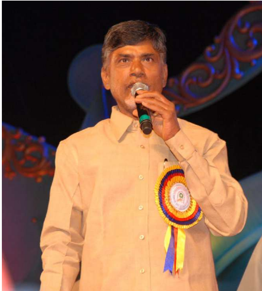
Sri Nara Chandra Babu Naidu, former Chief Minister addressing the gathering