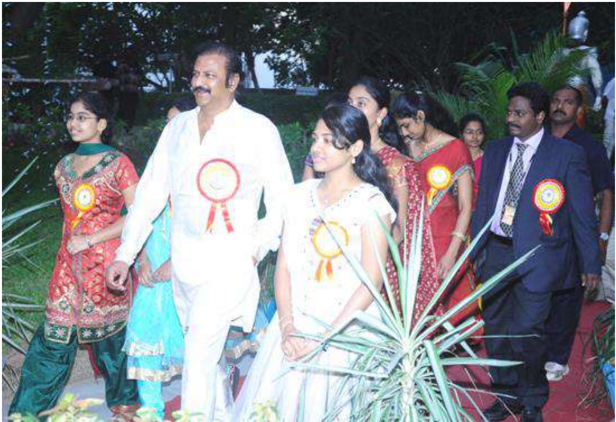
Honourable Chairman on his way to the venue