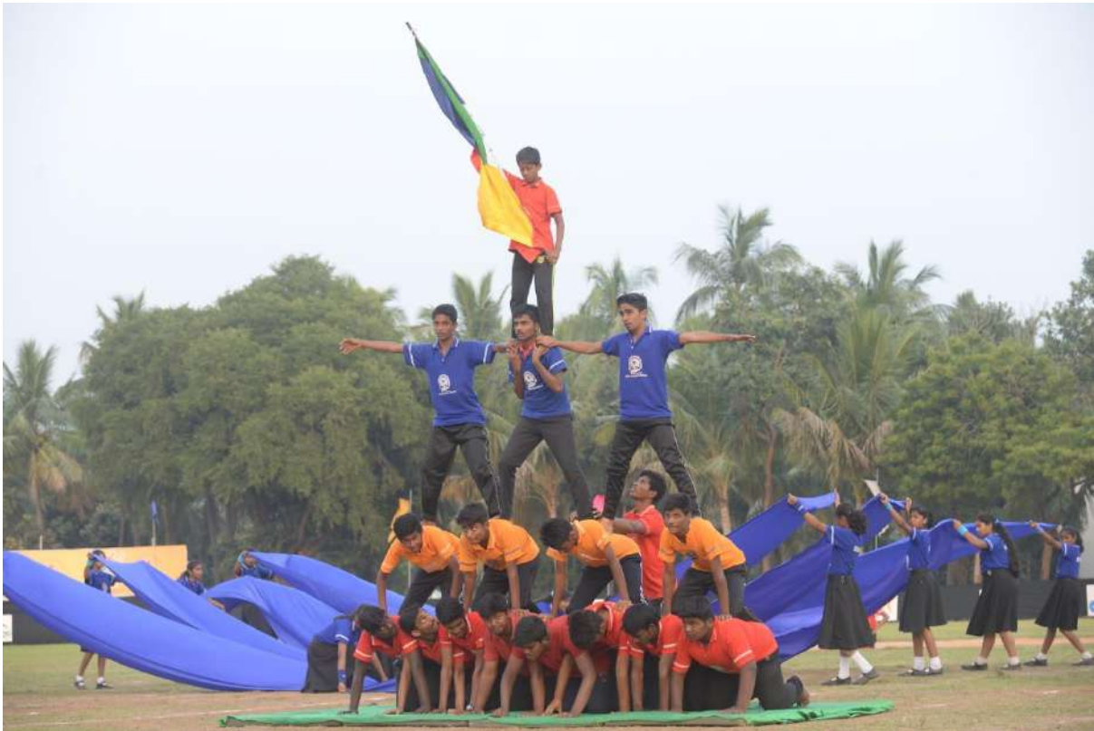
Spectacular formation of pyramids by the students