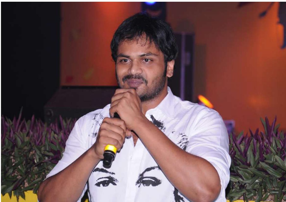
Sri Manoj Manchu, Film Artiste addressing the gathering