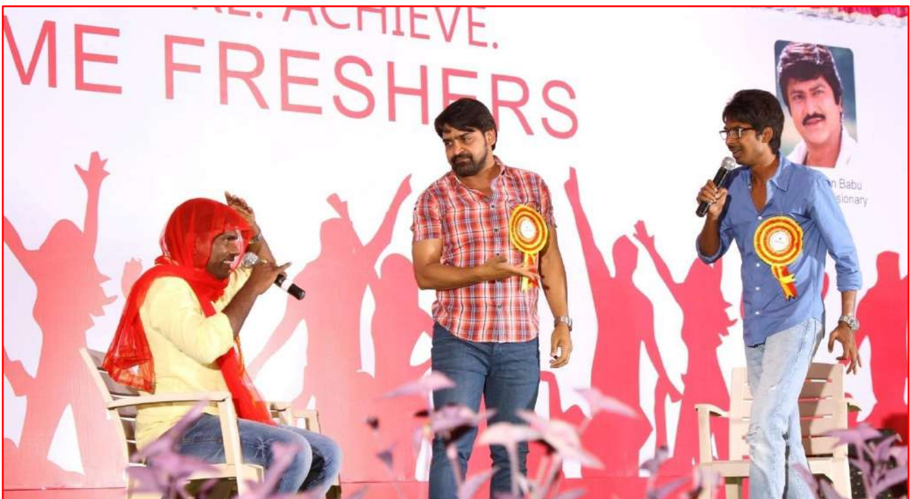
Skit program by 'Jabardasth' Team