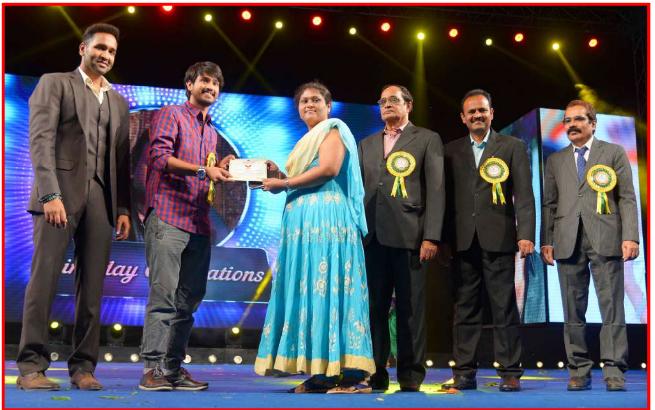
Sri Raj Tarun, Film Artiste Presenting the Gold Medal to the deserved student