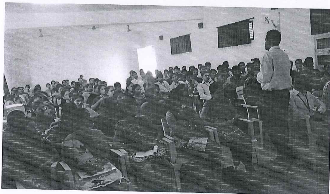
Students attended the programme on 08.07.2015

He also communicated the details regarding financial support by the Central Government to the students having innovative ideas. Around 130 students were attended the session. After attending the session the students gained the knowledge regarding Entrepreneurship and opportunities to start their new business. .