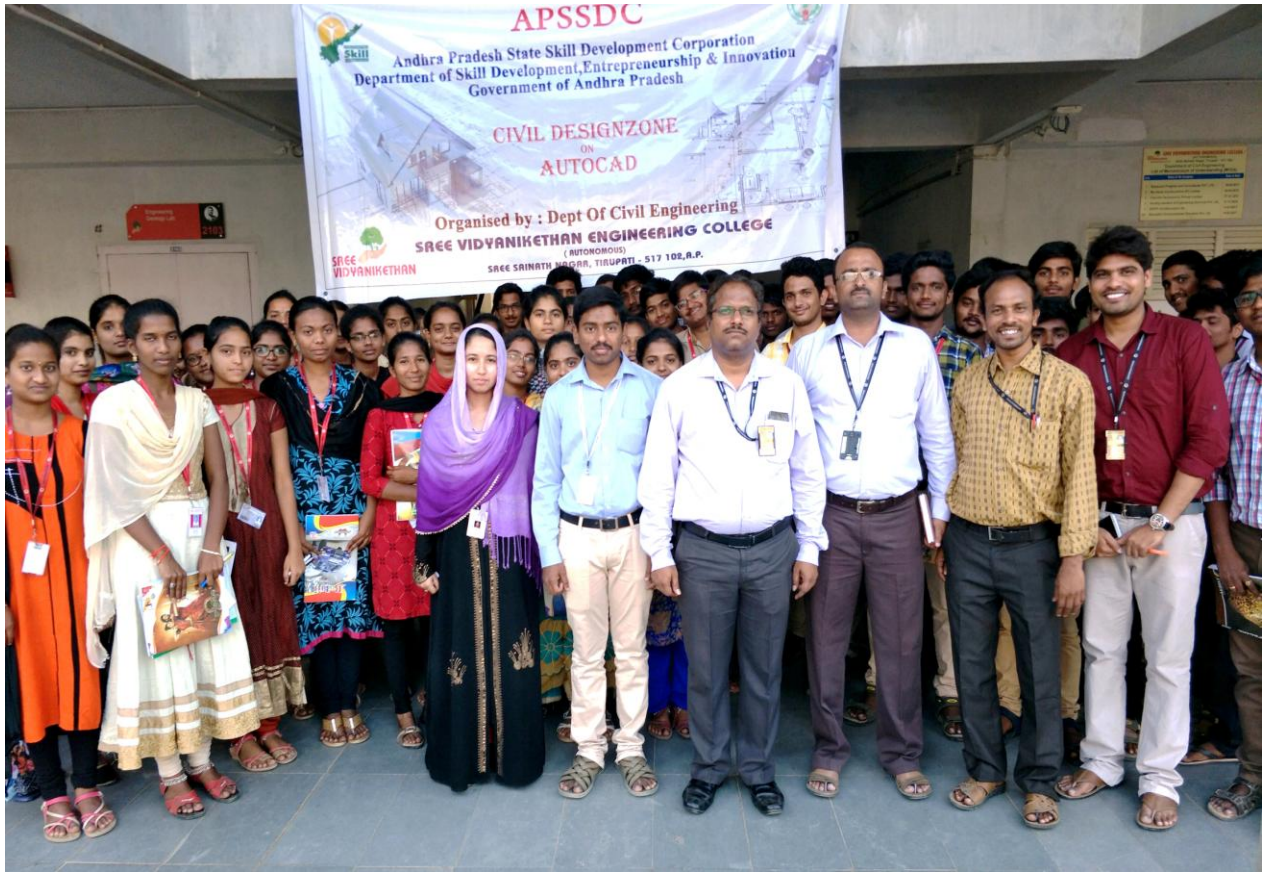
Group photo of faculty members and resource persons from APSSDC