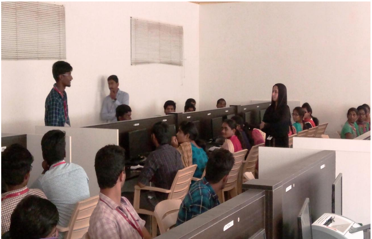
Student's interaction with the resource persons from APSSDC