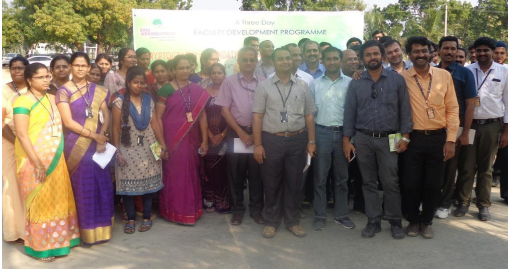
The participants of the three day FDP on "Cryptography: Foundations and New Directions in Research"