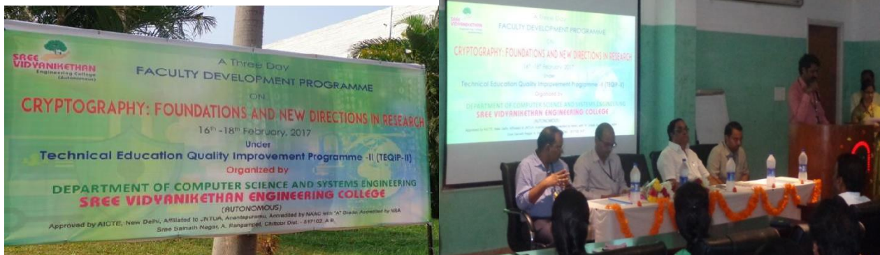
Entrance banner at the venue

This FDP mainly focused on Advances in Cryptography, Public Key Cryptosystems, Block Chain Technology, Applications of Public Key Cryptosystems, Post Quantum Cryptography and Randomness. The members of faculty from different colleges across the nation attended the FDP.