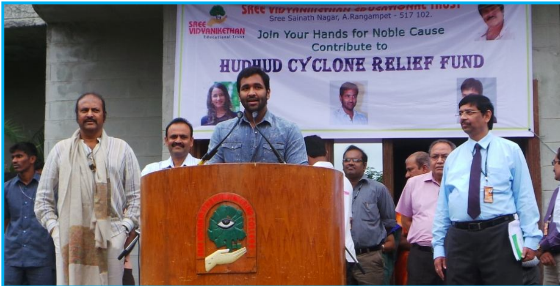
Hon'ble Chairman and Revered CEO advising the students to contribute for cyclone relief fund