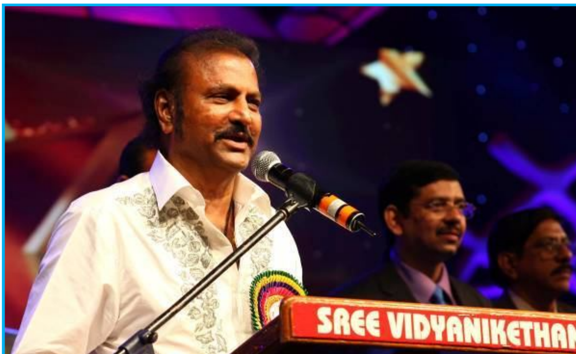
Hon'ble Chairman Dr. M. Mohan Babu addressing the gathering