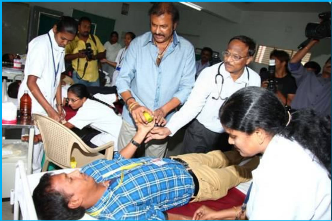
Hon'ble Chairman Dr. M. Mohan Babu inaugurating the Blood Donation Camp