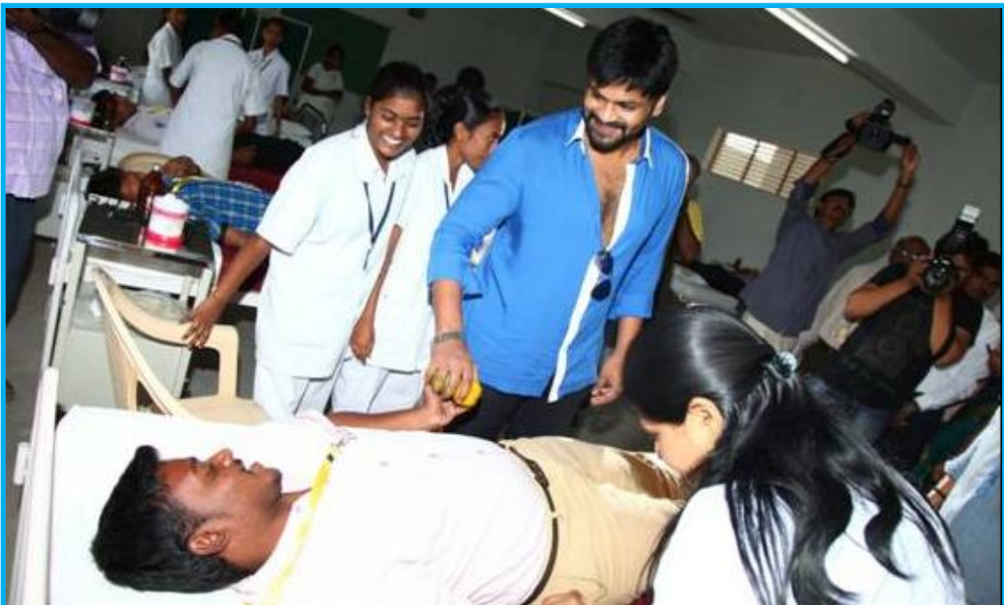
Sri Manoj Manchu, Popular Movie Artiste at Blood Donation Camp