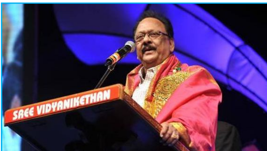
Sri U.V. Krishnam Raju, Former Union Minister and Popular Movie Artis recalling his experiences with students