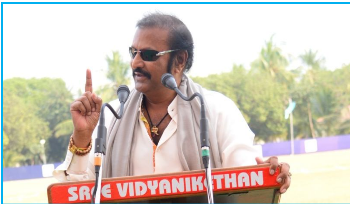
Hon'ble Chairman Dr. M. Mohan Babu addressing the gathering