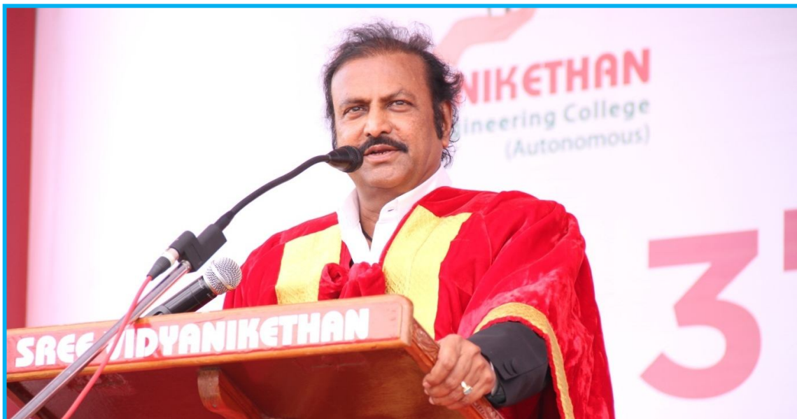
Dr. M. Mohan Babu, Hon'ble Chairman, SVET addressing the graduates