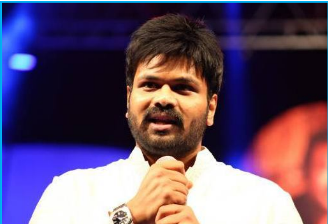
Sri Manoj Manchu, Popular Movie Artiste entertaining the gathering