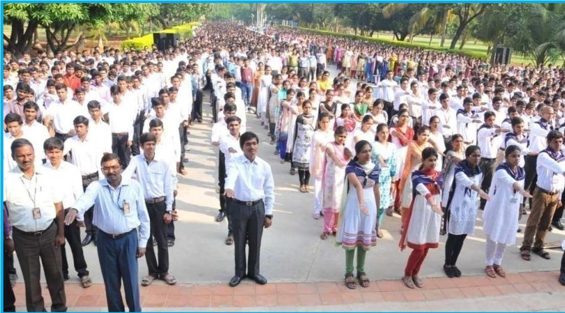
Huge gathering of students taking Swachhta Pledge