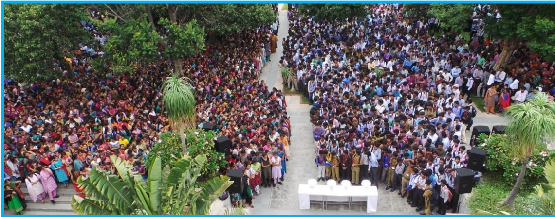
Huge number of students offering donations