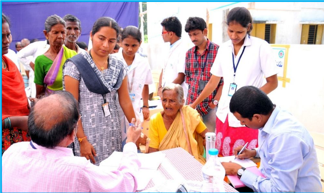
Doctors examining the patients from nearby villages