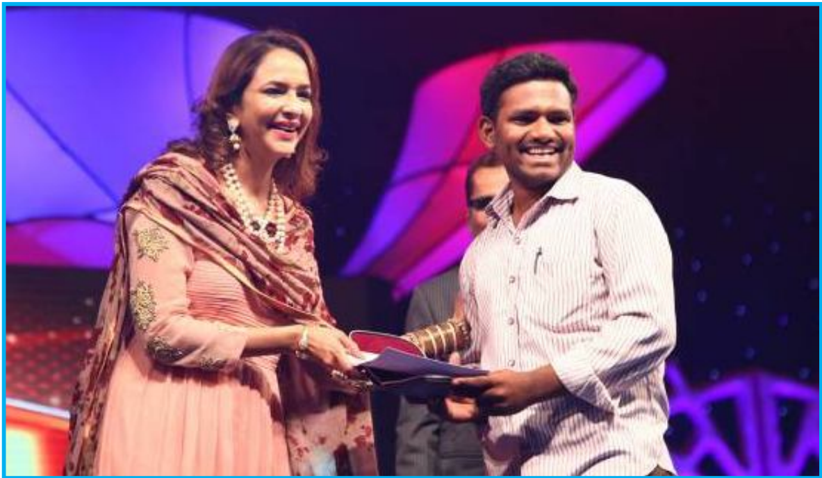
Ms. Manchu Lakshmi Prasanna, Popular Film Artiste and Film Producer presenting Gold Medal