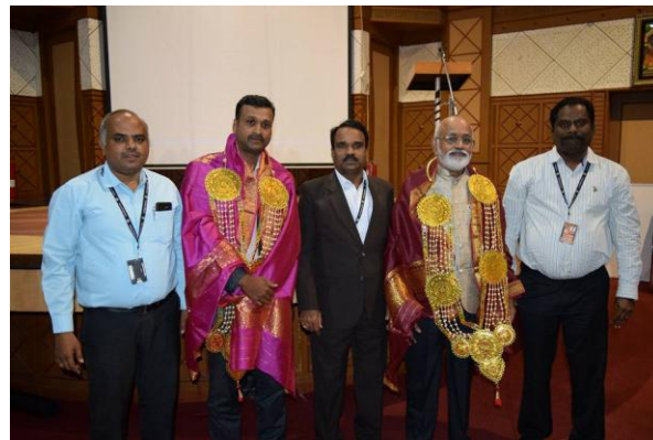
Felicitation of the Resource Persons