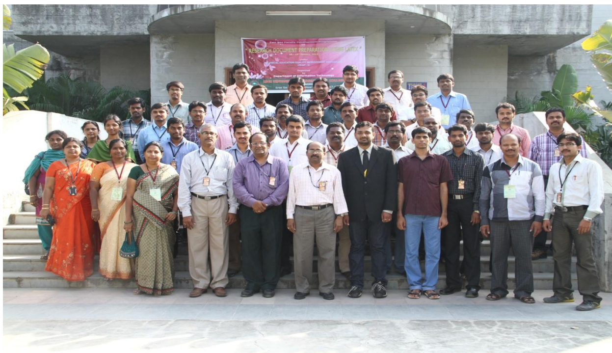
Participants of Two Day FDP on "Research Document Preparation using LATEX"