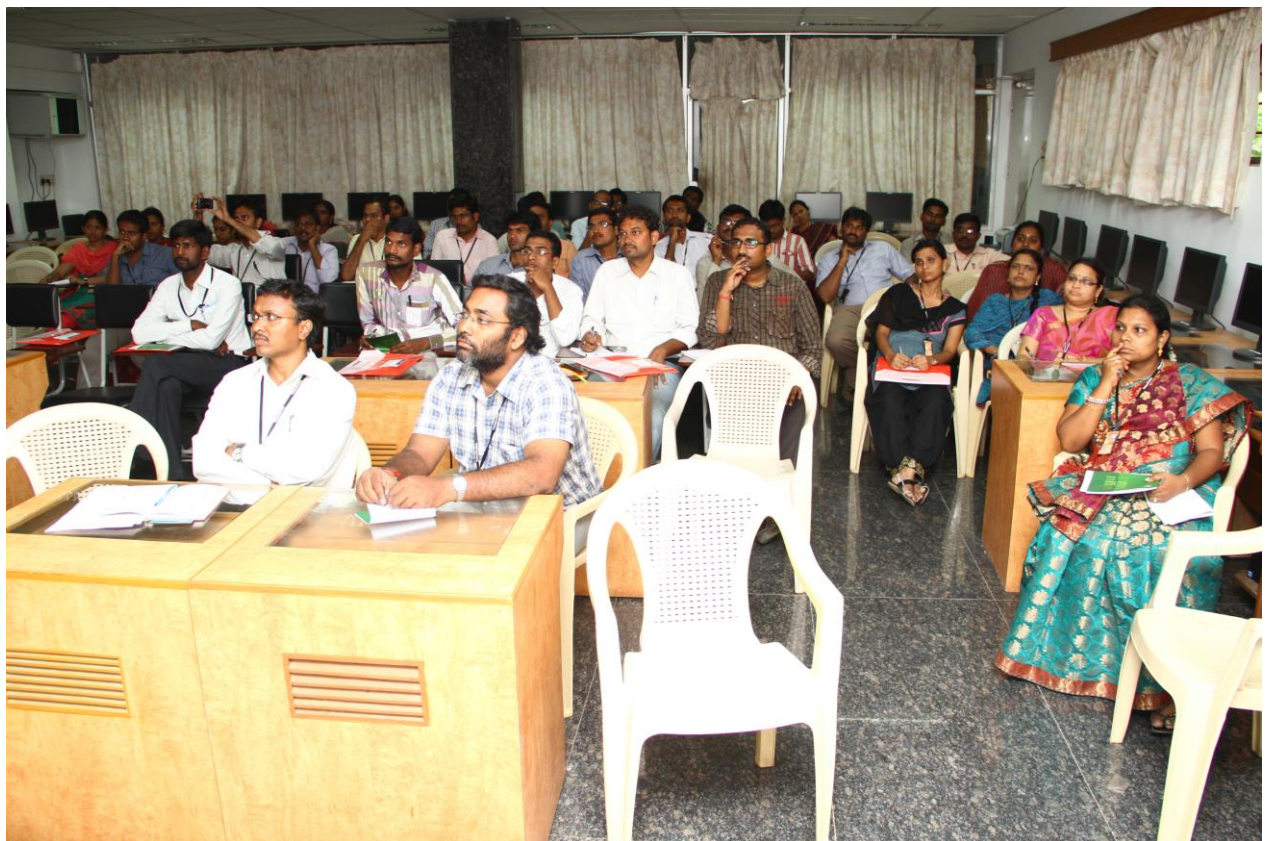
Cross section of participants