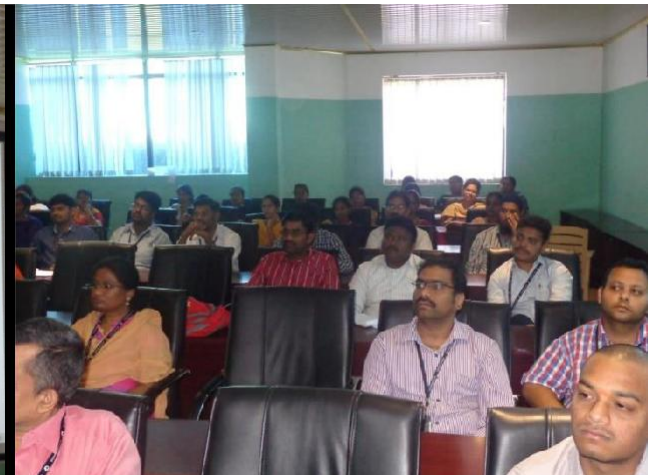
The participants listening ardently