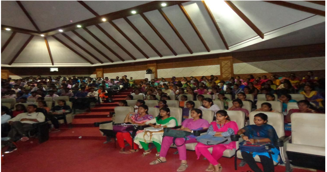
Participants in the Session