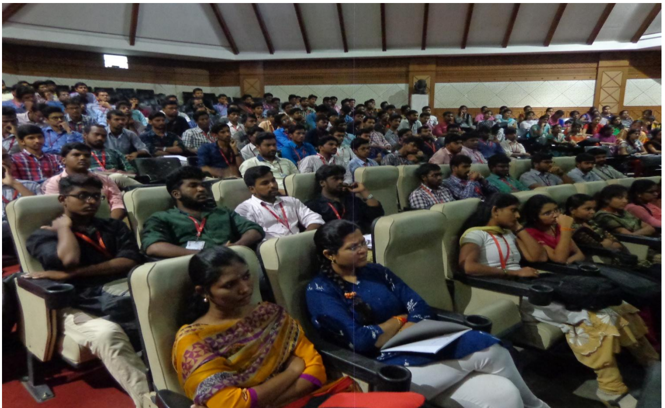
Participants in the Session