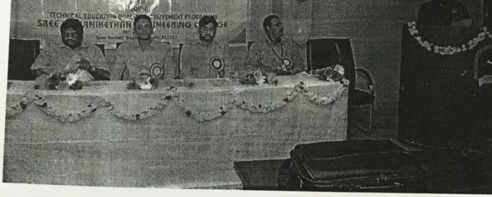
Chief Guest and Other Dignitaries in Inaugural Function