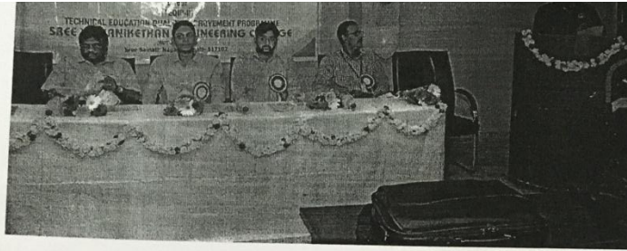
Chief Guest and Other Dignitaries in Inaugural Function