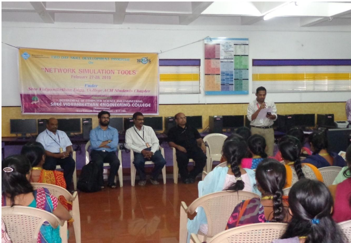
Inaugural Function Being Attended by Convener and Other Dignitaries.