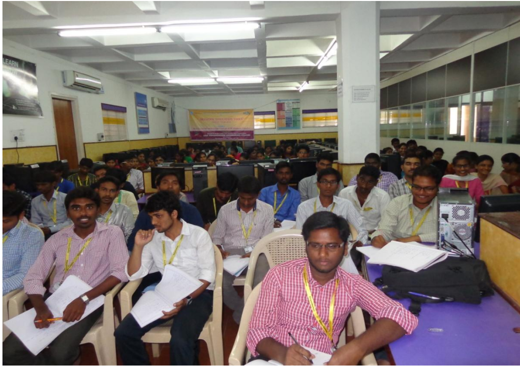
Participants During the Session