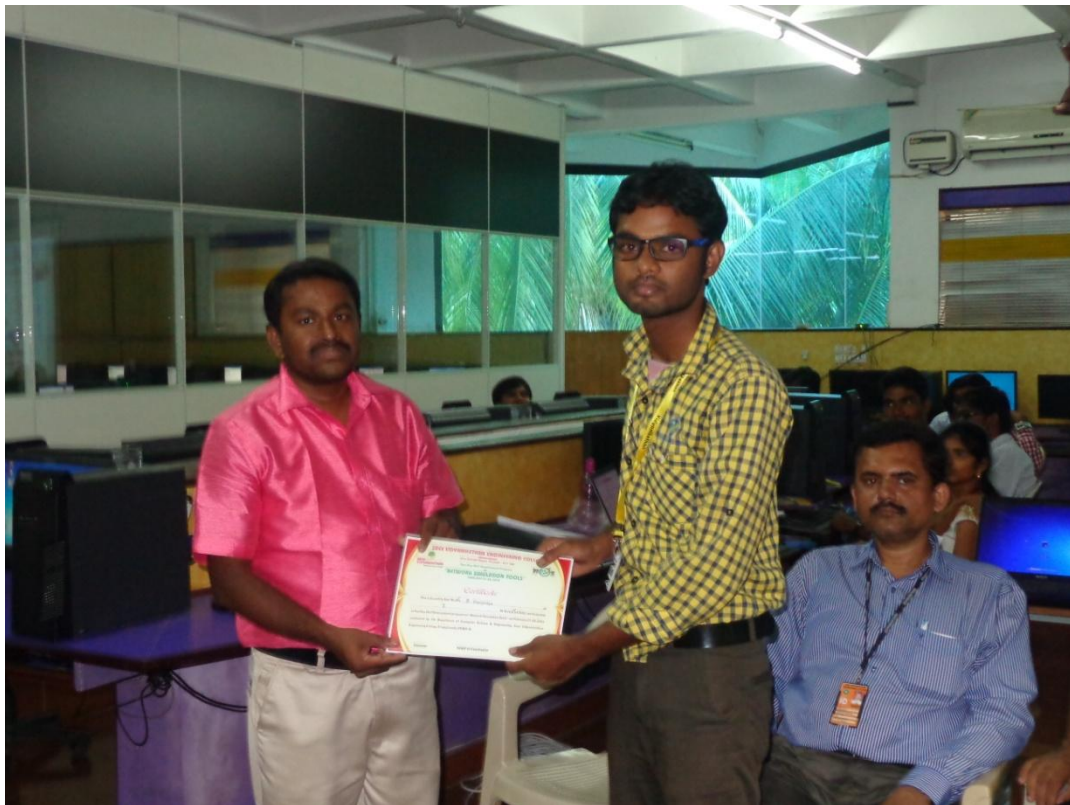
Certificate Distribution for the Participants in the Valedictory Function By Resource Person.